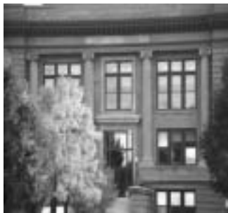
Dean's Office – Kepner Hall

(1994), Interim Associate Dean — B.S., Kansas State University; J.D., George Washington University