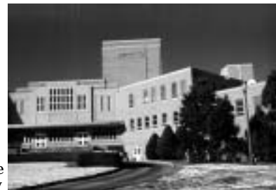
Dean's Office – Frasier Hall

(2001), Dean — B.M., East Carolina University; M.M., Southern Illinois University-Edwardsville; D.M., The Florida State University