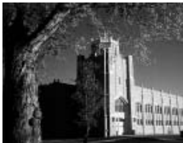
Dean's Office – Gunter Hall