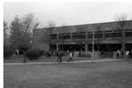
Dean's Office – Candelaria Hall

(1997), Dean — B.A., College of Saint Catherine, Ph.D., University of Wisconsin, Milwaukee