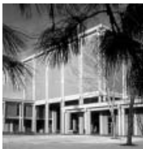
Dean's Office – McKee Hall