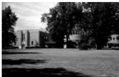
General Administration Offices are located in Carter Hall.

Note: The UNC administration is listed with highest degree following the name. Parentheses is the first year of employment at UNC followed by degrees conferred.