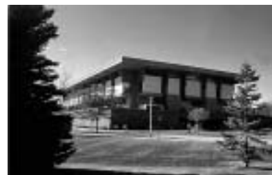
Dean's Office - Michener Library

(1987), Dean — B.A., M.A., University of Wisconsin, Milwaukee; Ed.S., Appalachian State University; Ed.D., University of Northern Colorado