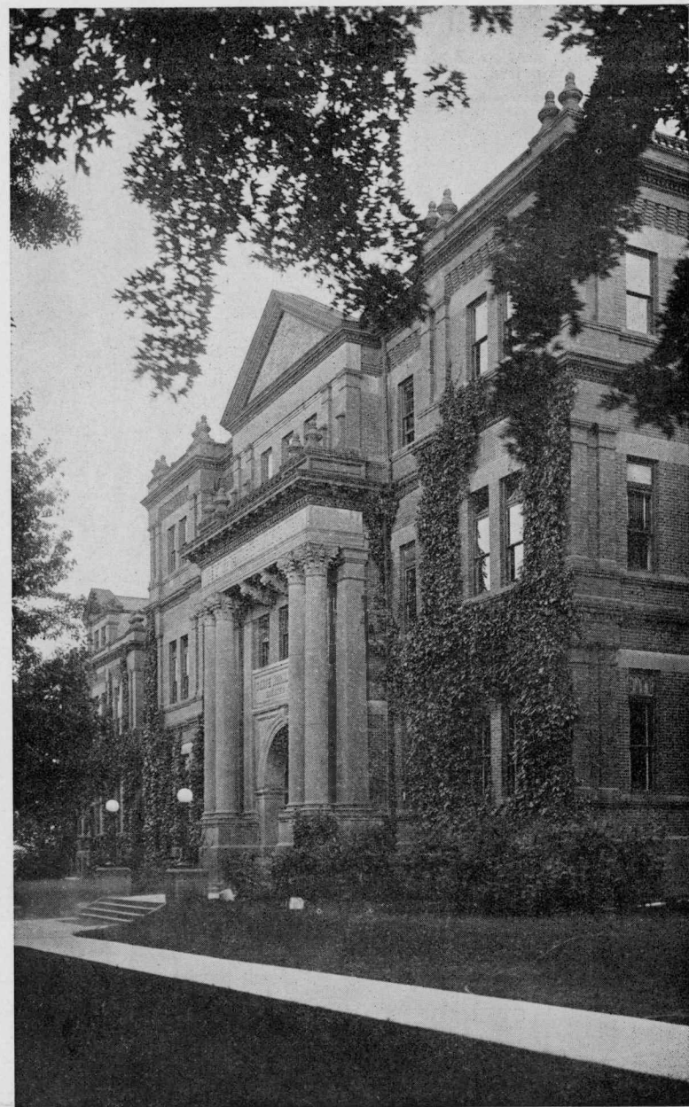
THE ADMINISTRATION BUILDING

Begins June 15: First half, June 15-July 21; Second half, July 22-August 26.