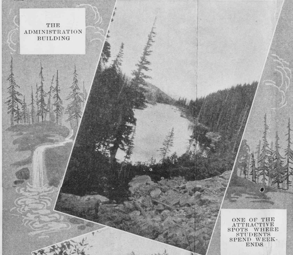
ONE OF THE ATTRACTIVE SPOTS WHERE STUDENTS SPEND WEEK- ENDS