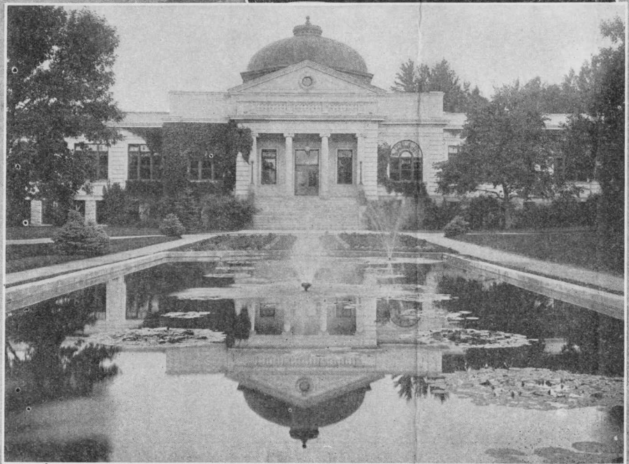
THE LIBRARY AND LILY POND

I N PLANNING for the Summer Quarter of 1925, Colorado State Teachers College has contracted for the services of the foremost specialists in their respective fields.