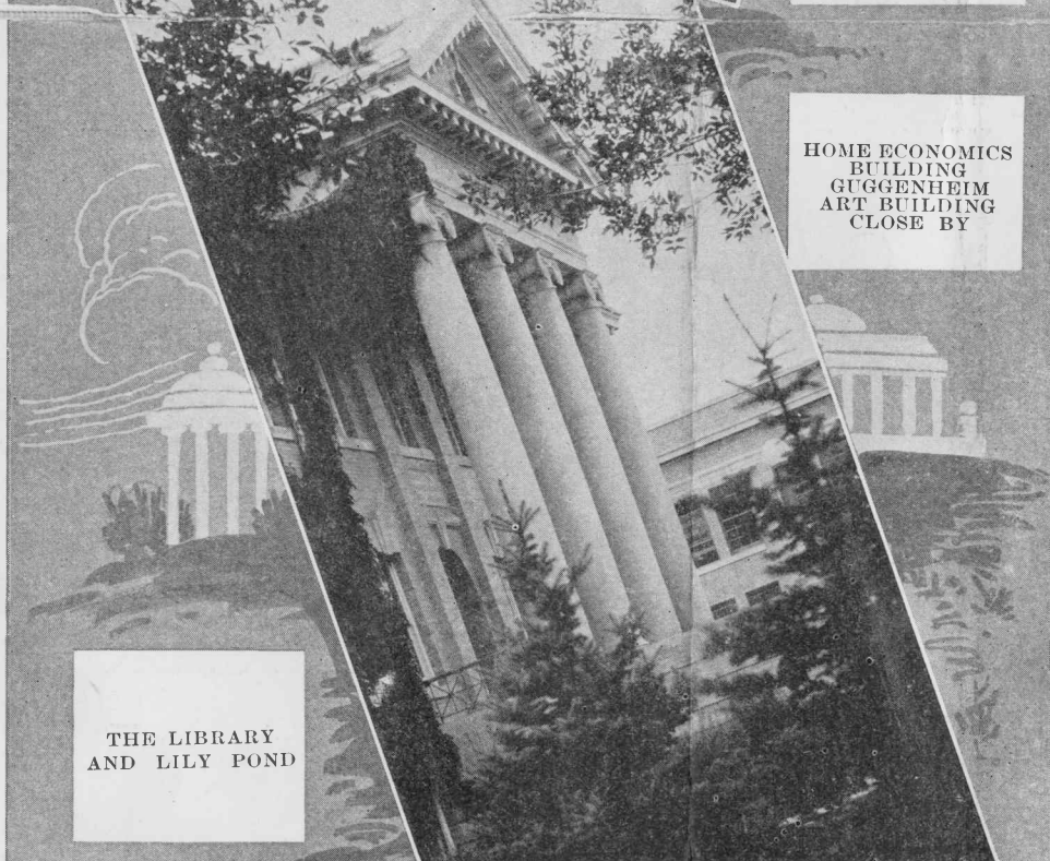
HOME ECONOMICS BUILDING GUGGENHEIM ART BUILDING CLOSE BY