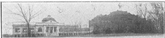
The Center of Western Teacher Training