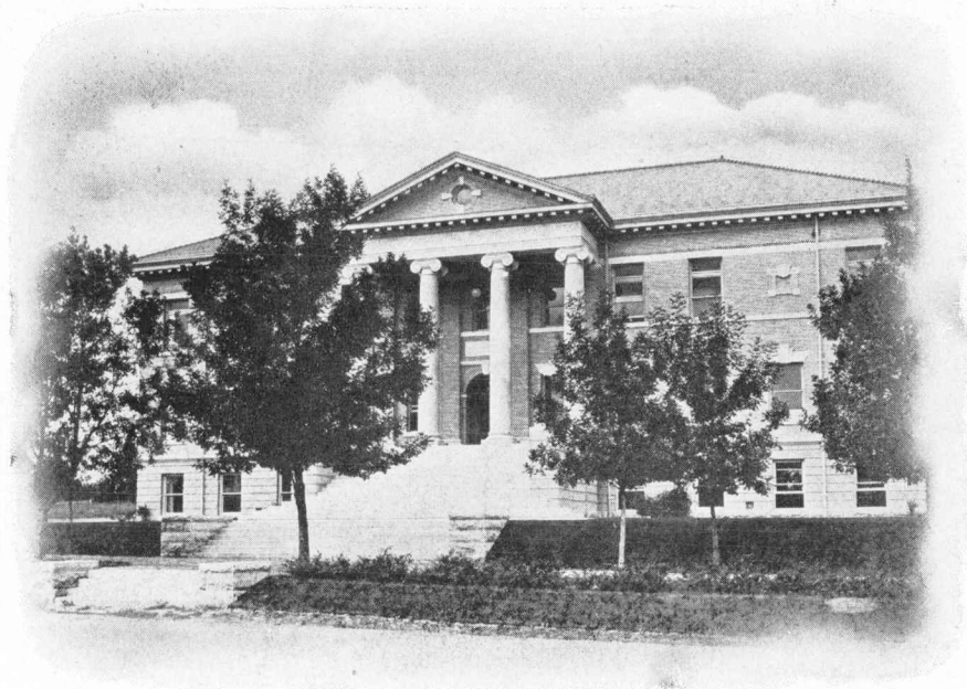
Simon Guggenheim Industrial Arts Building.