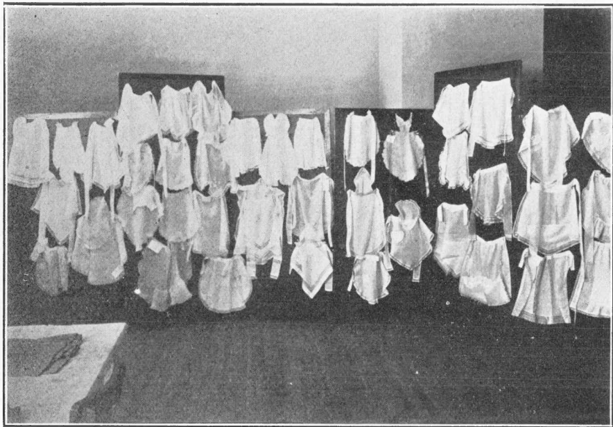
SEWING DEPARTMENT—Collection of Aprons Made by Students.