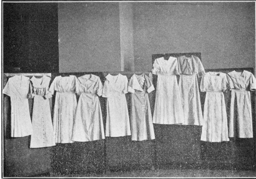
SEWING DEPARTMENT—Summer Gowns Made by High School Girls Under Direction of Practis Teacher.