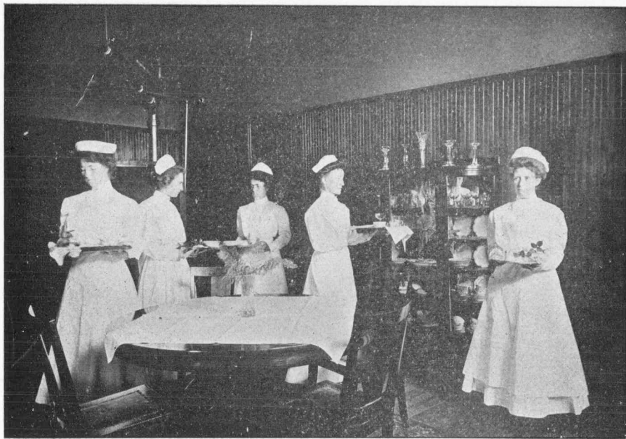
DOMESTIC ART—Training in Serving.