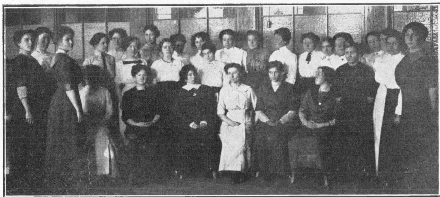
DOMESTIC SCIENCE —The Gowns Worn Are Made by Those Wearing Them.