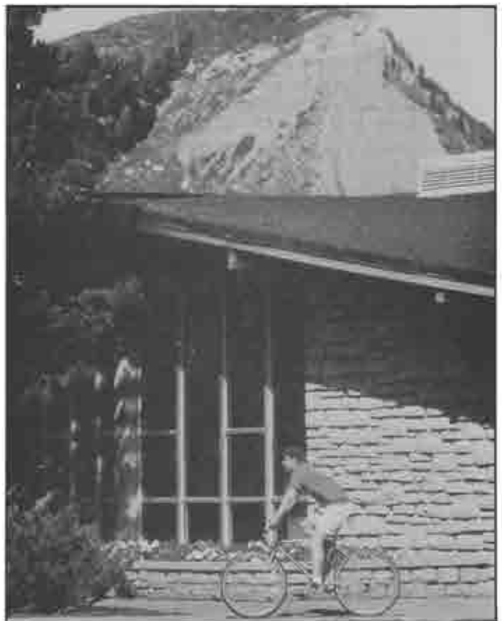
A student rides his bicycle in front of Cooper Hall with Perins Peak in the background.

NOTE: Satisfaction of this auxiliary requirement may be accomplished by selecting lab courses for two of the three Group B General Distribution requirements.