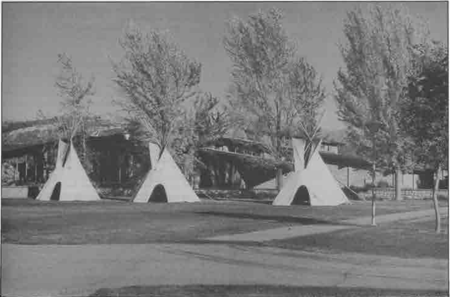
Southern Ute Indian teepees on display in front of the Native American Center on campus. About 14 percent of the student population is Native American.

**Completion of either BA 302W or BA 407W fulfills the Group W requirement for students in the tourism and resort management option.