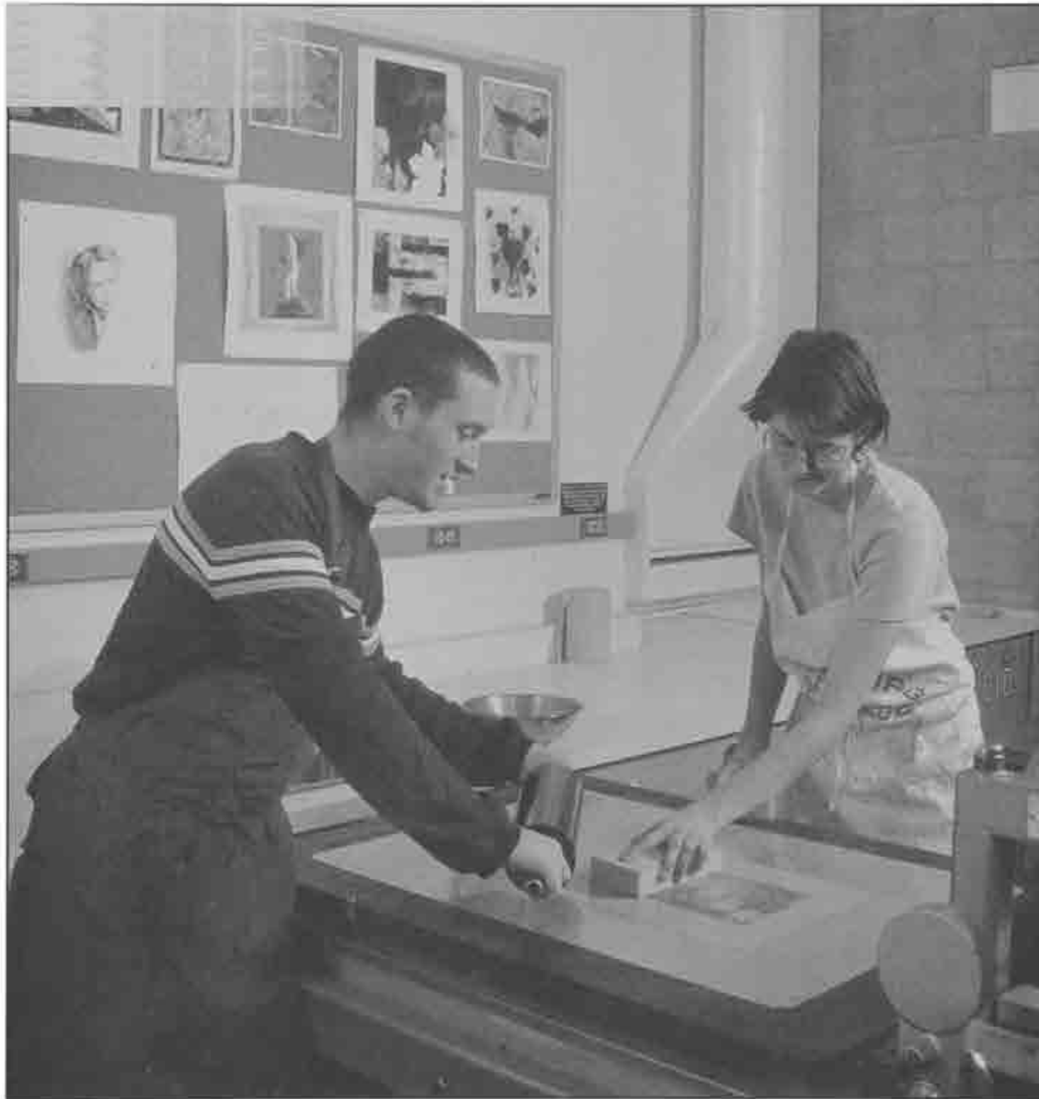
Students prepare a lithographic printer in the printing studio in the college's $4 million Art Building that opened in Fall 1997.

Action as Responsible Application of Academic Learning – Using all of the above to make the world a better place. Such action is characterized by tolerance, respect, and application of academic learning.