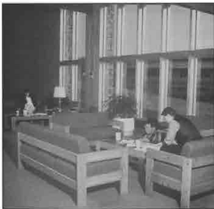
Students take advantage of a quiet moment to study in the Student Memorial Lounge.