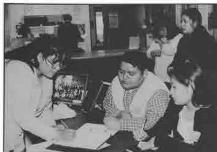
Students sign up a participant in the annual American Indian Science and Engineering Society regional conference at Fort Lewis College.

Geographic information science is a new field that merges skills and theory across many different disciplines, such as archaeology, biology, engineering, geology, as well as geography. These skills are also applicable to the social sciences, business and education. The workhorse tool used in this new field is the geographic information system or GIS. A GIS is a database storage system which analyses spatial data for the purpose of characterizing and solving real world problems. Completion of the GIS minor will provide the student with skills and experience in the five essential elements of a geographic information system. These elements include data acquisition, preprocessing, data management, manipulation and analysis and product generation.