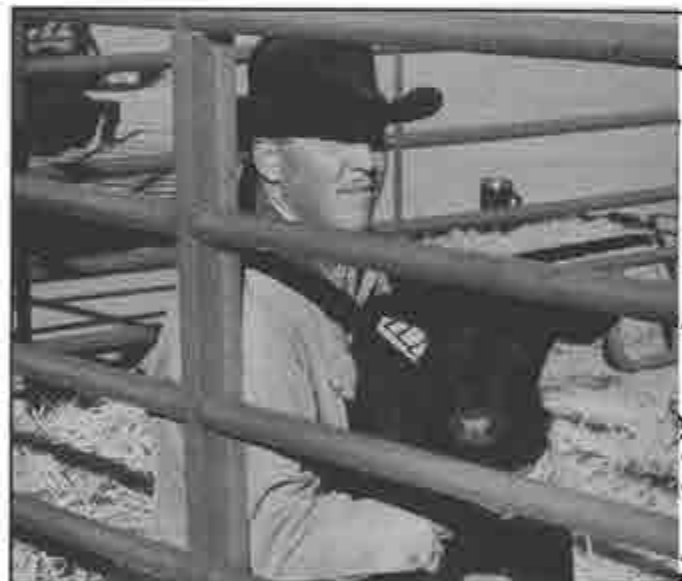
A student with the Westerner's Club shows off a calf.