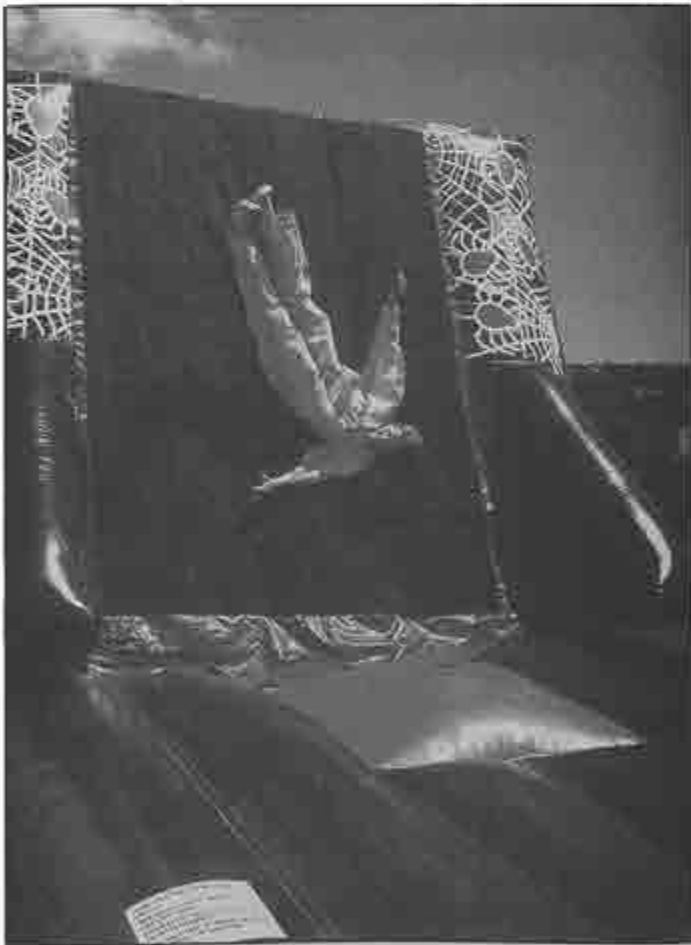
A student experiences the fun of a "velcro wall" at the annual Spring Fling celebration.

To graduate from Fort Lewis College, each student must submit a signed "Petition for Candidacy for a Degree," which can be obtained from the Records Office. The signed petition must be returned to the Records Office within a month after the completion of 80 credits for the bachelor's degree and after the completion of 30 credits for the Associate of Arts degree. All requirements for major(s) and minor(s) specified on the original petition must be completed prior to a degree being awarded. Also, the graduation fee must be paid by that date. The student may petition for a minor on this form.