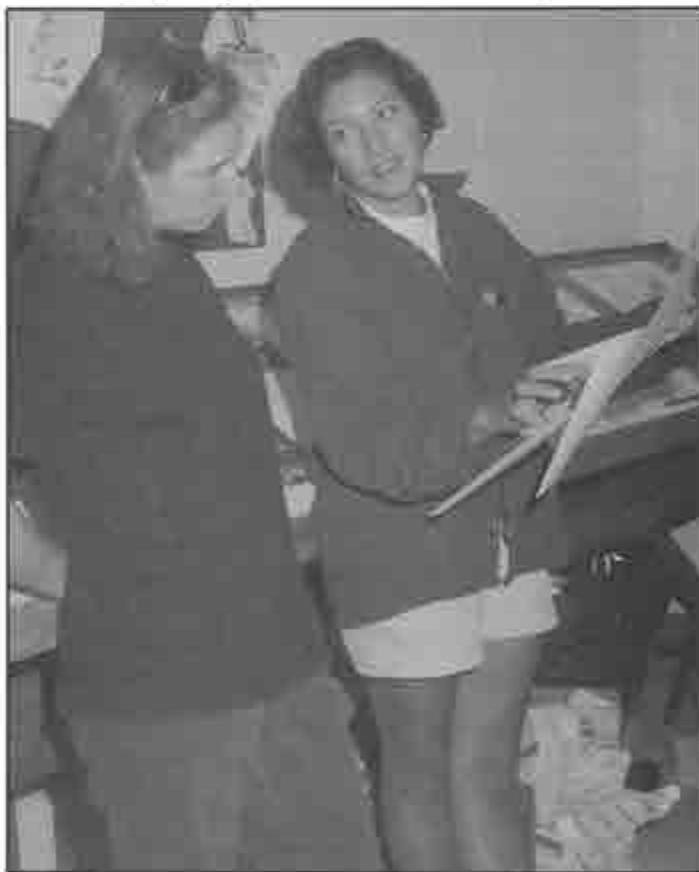
Students confer on a story for The Independent , the student newspaper at Fort Lewis College.

Ten college-wide computer labs are available to the general student population. College labs are located in each of the main classroom buildings, including Berndt Hall, Noble Hall, Hesperus Hall, Sage Hall and Reed Library. Windows and Macintosh computers, printers, and a wide variety of software are available. All lab computers have full Internet connections, and every registered student receives an Internet account for electronic mail. College computer labs are typically available seven days a week except during holiday periods, and any registered student has access. In addition, about twenty special-purpose labs serve students in specific academic