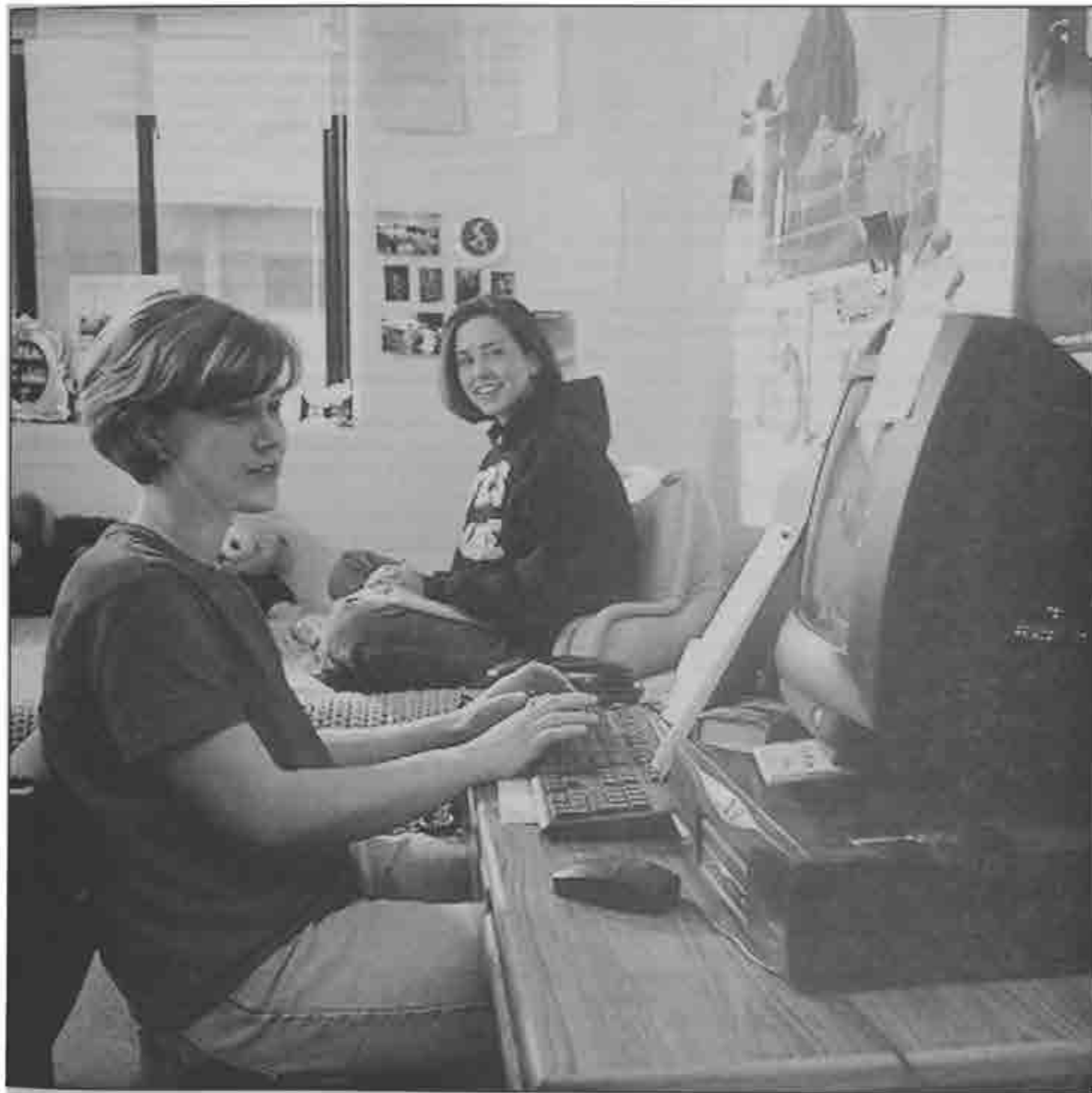
Students study in their room in West Residence Hall.