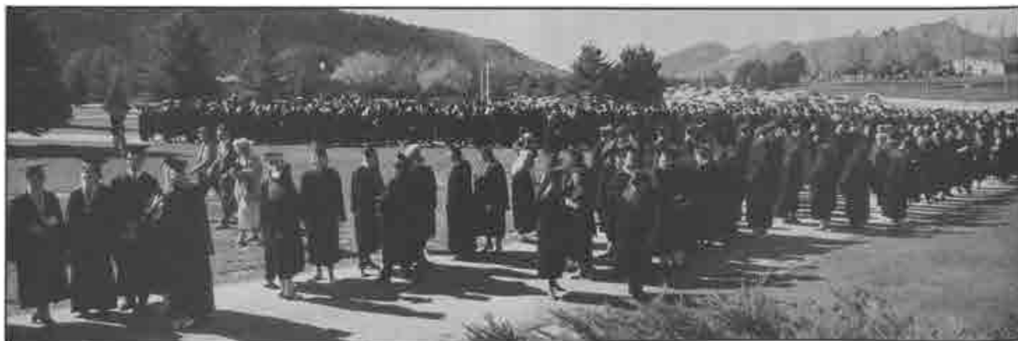
Graduates line up on a beautiful spring day to get ready for the graduation march.