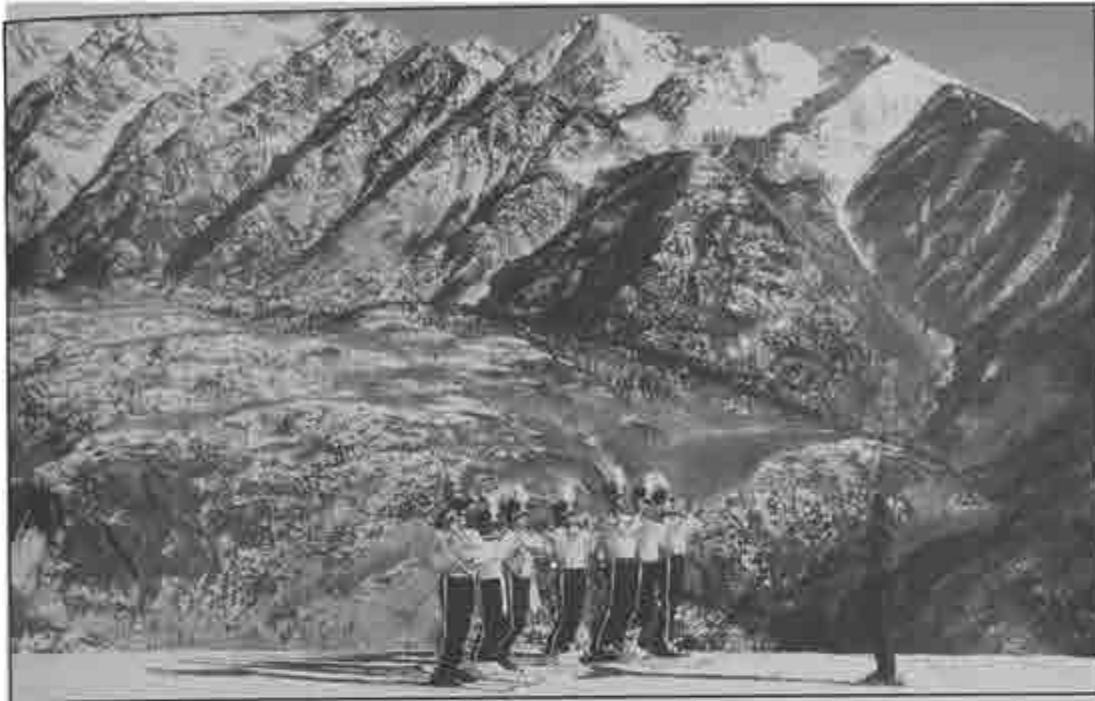
Fort Lewis College Music students play a fun concert on the slopes at Purgatory Ski Resort. The Twilight Peaks are in the background.