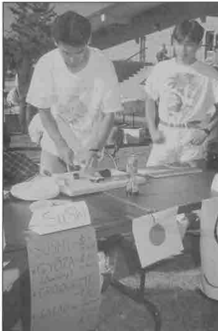
Two Japanese students share their country's cuisine at the college's annual International Extravaganza.

A major in philosophy will provide a sound foundation for graduate studies in philosophy and will also serve as an excellent