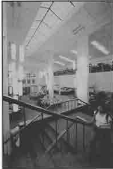
The John F. Reed Library has more than 185,000 books, 38,600 micro-forms and 900 magazine and journal subscriptions as well as access to 30 million holdings through the INNOPAC online system.

The work offered in English deals with several aspects of liberal education: the linguistic and literary history of Western culture; selected studies in non-Western literature in translation; human values; the relationships between cultures in the Southwest; and written and oral communication, both utilitarian and creative.