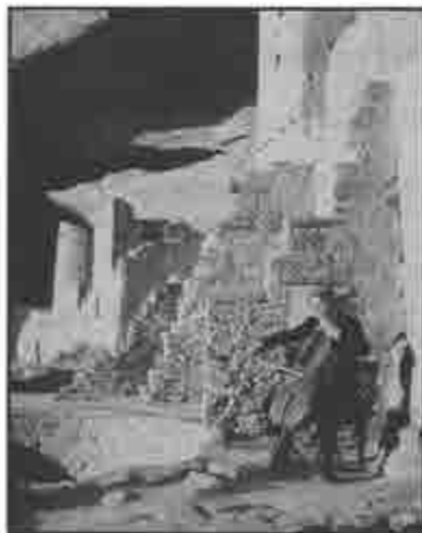
A cello player at Cliff Palace in Mesa Verde National Park.

In today's complex society, the need persists for the educated person to be aware of the important role played by the arts. The Fort Lewis College Music Department, an accredited member of the National Association of Schools of Music, provides an opportunity for all students to be actively involved in the expansion of their understanding of music. The discipline and sensitivity developed by the study of music provides an excellent background for many and varied careers. The Music Department awards both majors and minors in music.