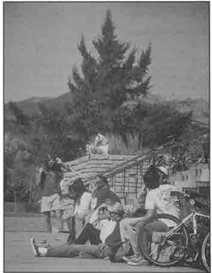
The Library steps are a popular hangout during a warm, sunny fall day.

**Completion of Econ 472W, BA 302W, BA 401W or BA 407W fulfills the Group W requirement for students in the business administration option.