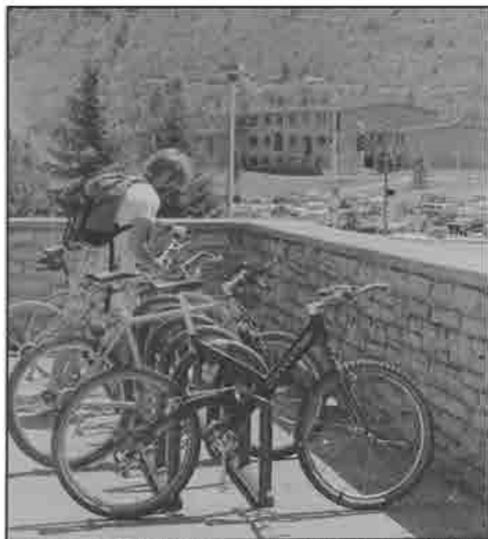
A student unlocks his bike from a rack at the College Union Building. On-campus apartments are in the background.