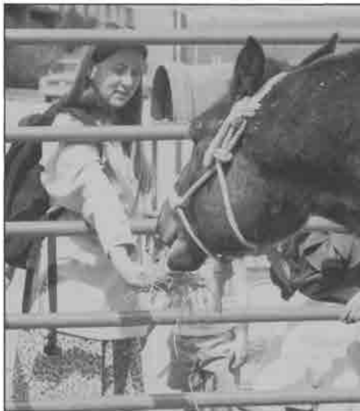
A student feeds a horse at the Westerner's Club petting zoo held every spring on campus.