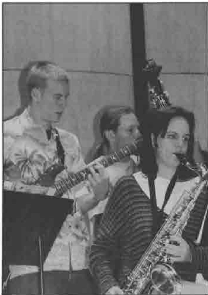
Members of the Fort Lewis College Jazz Band rehearse for a performance.

Students may elect to complete concurrently the requirements for two majors. The "Petition for Candidacy for a Degree," which can be obtained from the Records Office, must be completed with both majors listed within a month after completion of 80 credits and submitted to the Records Office. Any major or minor additions or changes after submission of the original "Petition for Candidacy for a Degree" must be made on the original form in the Records Office.