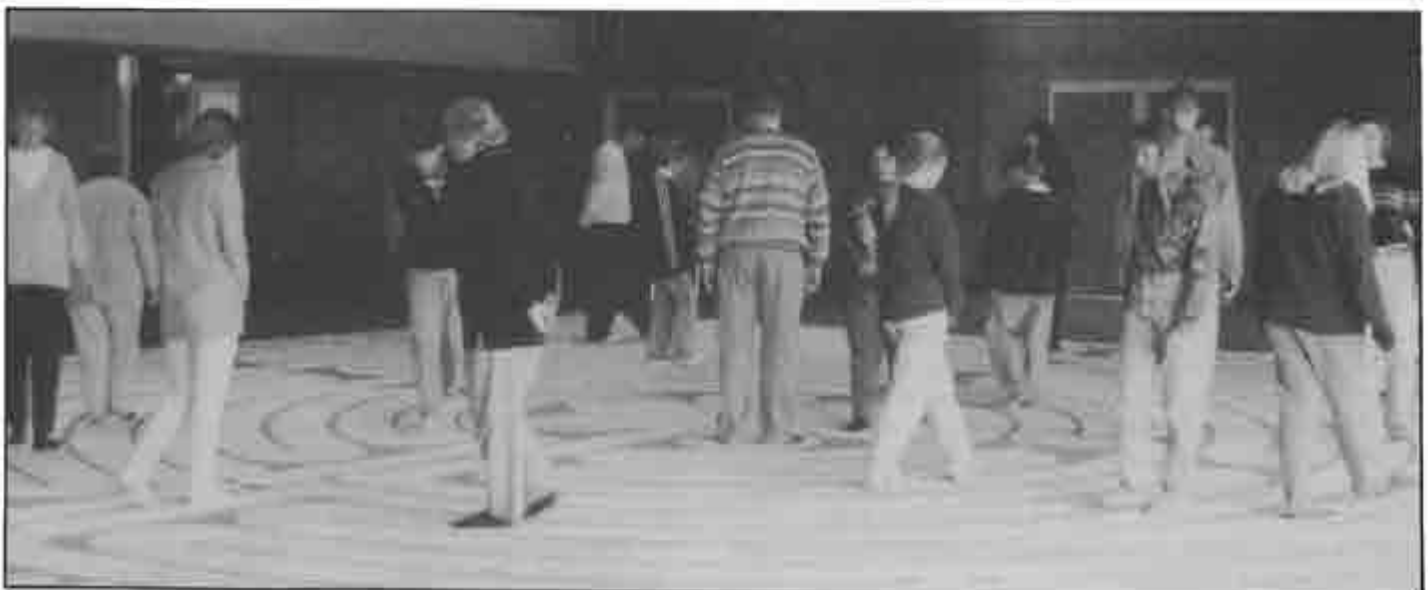
Students, faculty and staff take time out from their busy day to walk a meditation labyrinth as part of a Wellness Committee activity.

See Modern Languages on Page 80. Course listings begin on Page 144.