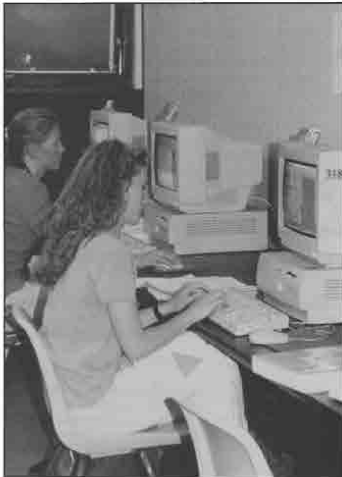
Students work on assignments in one of the college's computer labs.

The Engineering program is supported by the college's modern computer facilities. Registered students may use any of the student