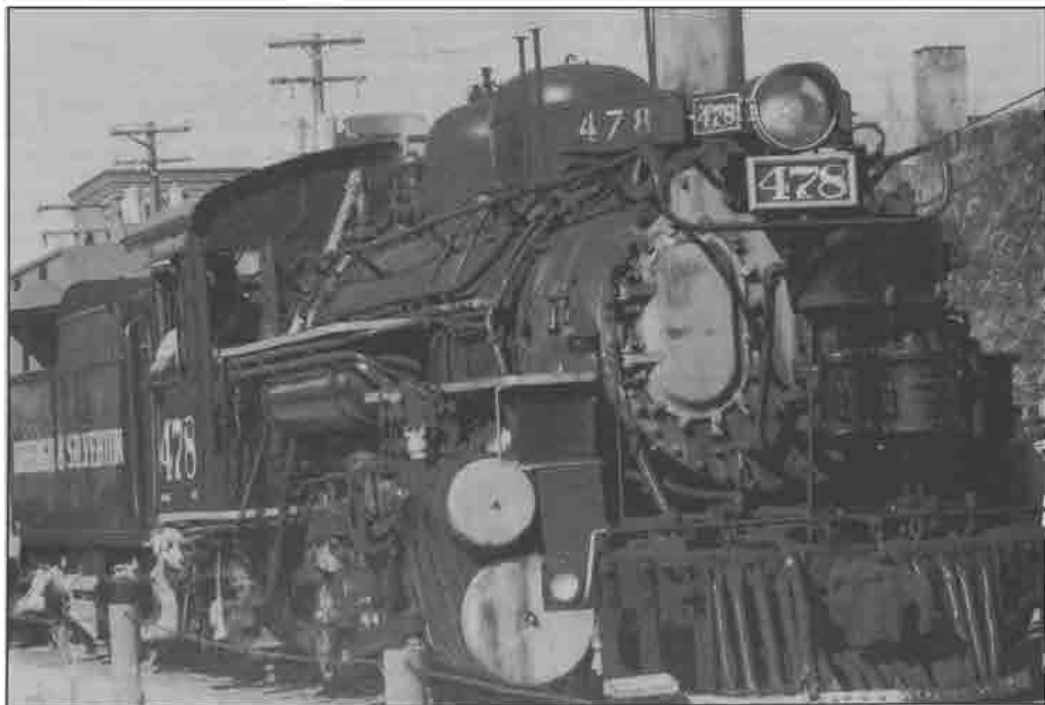
The Durango & Silberton Narrow Gauge Train pulls out of its downtown Durango station. The train is a major tourist attraction in the Southwest.

**Completion of either BA 302W or BA 407W fulfills the Group W requirement for students in the tourism and resort management option.