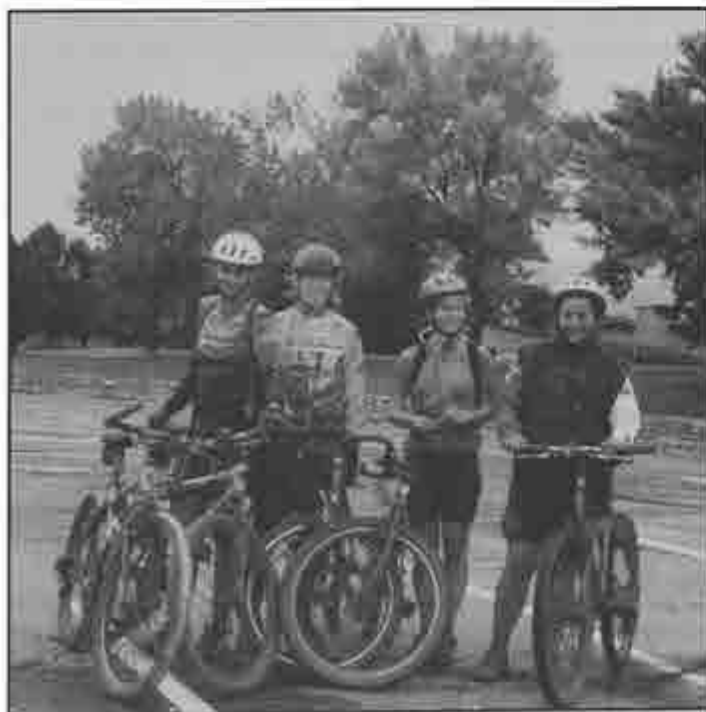
Members of the Skyhawk Mountain Bike team are able to smile despite the mud and rain during a training session.

Courses sponsored by the Center offer students the opportunity to improve their basic skills in writing, reading and mathematics. In addition, the learning skills classes aid entering freshmen in