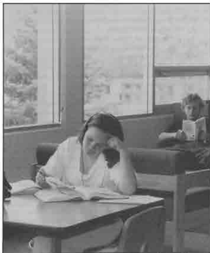
Students take advantage of the light pouring through the windows of the John F. Reed Library on campus.

A minimum of 15 credits of business administration courses at the 300- or 400-level, with at least one course from each group.*