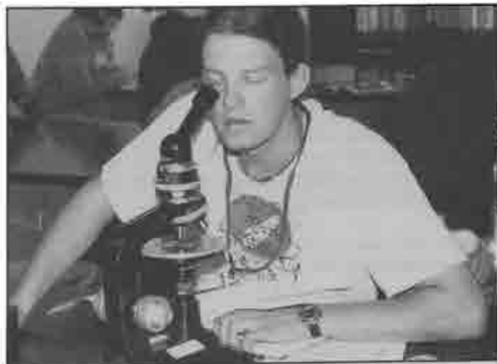
A geology student peers through a microscope at a rock specimen.

The physics curriculum is predicated upon the role physicists play in a modern, technological world society that is currently experiencing shortages of trained personnel in various scientific areas and in science education. Coursework in physics will provide the student pursuing entrance to graduate school in physics or astronomy with a strong grounding in mathematics and physics, while being immersed in an atmosphere of a broad, liberal education in the humanities and social sciences. This curriculum also will enable a student to enter applied technical fields in industry such as electronics, optics and aerospace, where there is currently a high demand. Students seeking a degree in physics should consult early in their college career with staff members of the Physics Department.