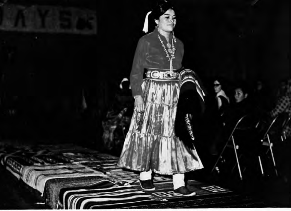
Hohzoni Days — Modeling Tribal Dress