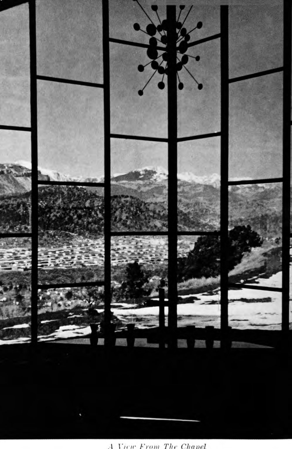
A View From The Chapel