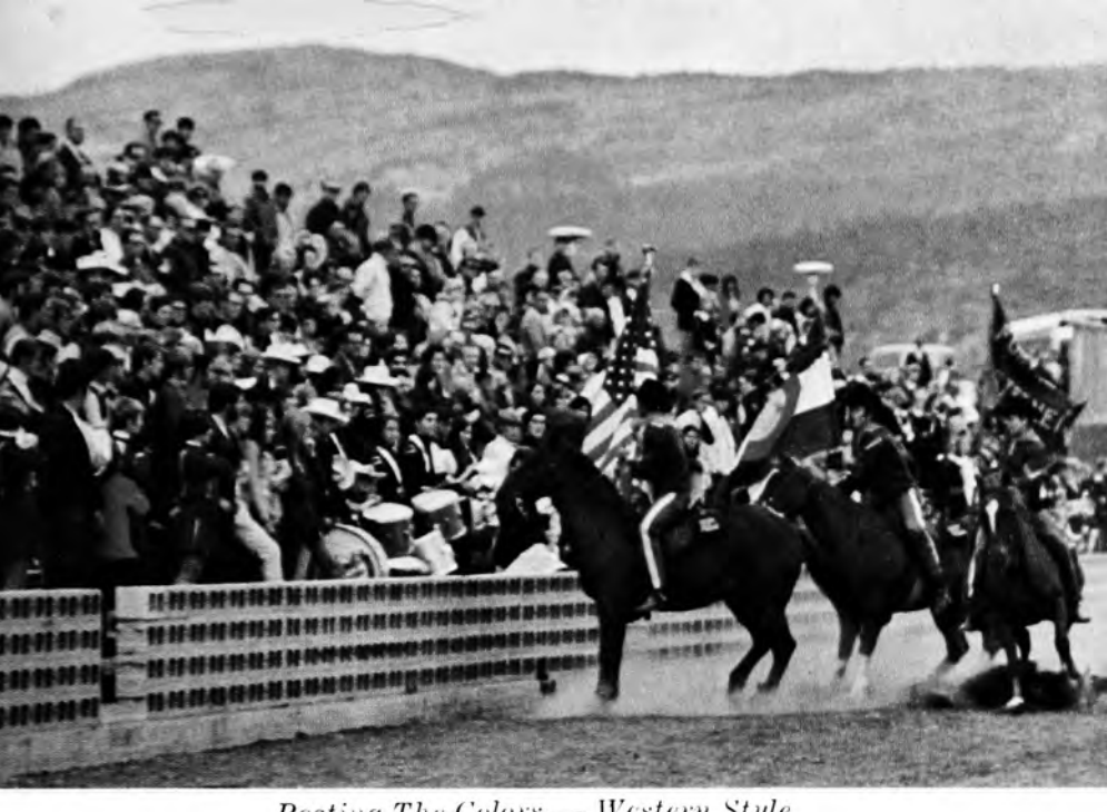
Posting\ The\ Colors -- Western\ Style