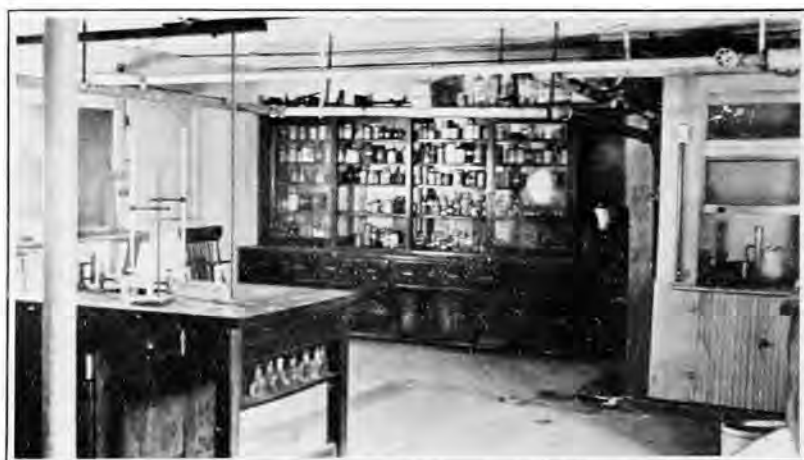
In Our Chemistry Laboratory

Farm Mechanics (Second Year). —Five periods a week for twenty-four weeks. Text—Davidson and Chase. A study of farm machinery and motors. The underlying principles of farm machines of various types, a detailed study of these machines and their care is made. The various forms of power available for farm use, such as windmills, gas engines, steam engines, water wheels and electric motors are studied and compared.