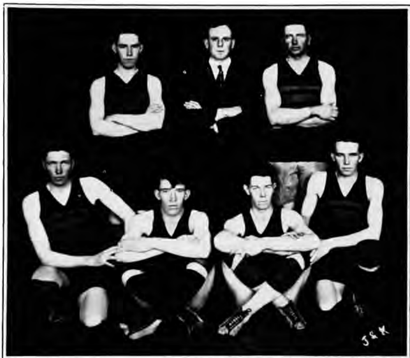
Our Boys' Basketball Team is a Strong One

The boys' basketball team made the best record yet made by a Fort Lewis team. Nearly all members of the first team will return next winter, and the second and third teams are strong, so we expect an unusually fine showing.