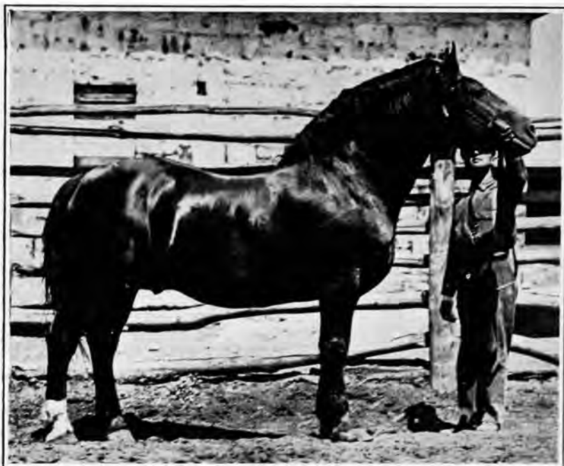
One of the Best Animals at the School

Horticulture (Second Year). —Texts in vegetable gardening and fruit growing are used. A study of the best vegetables to grow at high altitudes is made, together with the best soil, water and cultural conditions. Some time is given to the plant and insect enemies of vegetables and to the best methods and conditions of storage. During the second term fruit growing is pursued. The best planting and cultural conditions for strawberries, raspberries, currants, gooseberries and hardy tree fruits are studied. Insect pests and how to destroy them are given much attention. Attention is also given to packing, marketing and storing fruit.