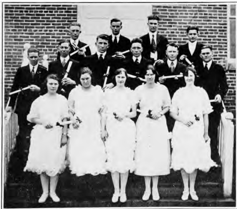
Our 1922 Graduating Class

More experimental work is being done this year on the preserve. The work with field peas is particularly extensive. In addition to the experimental work with peas, corn, potatoes, oats, barley, wheat, alfalfa, grasses, clovers, strawberries, raspberries, apples, cherries, plums, etc., we are trying many varieties of head lettuce this year. Farmers find that good head lettuce, cauliflower and early potatoes bring in a considerable income before the regular farm crops are ready for market.