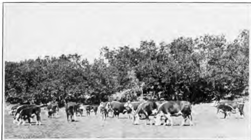
The School Livestock is Used for Practice in Judging