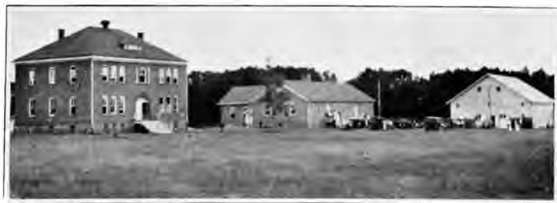
All of the Twenty-one Campus Buildings Are Well Equipped

There are twenty-one large buildings on the campus; convenient in arrangements, lighted by electricity, and supplied with running water. They include the school building, two boys' dormitories, girls' dormitory, dining hall, shops, power house, gymnasium, dairy buildings, residences, barns, and storehouse. The school building, dormitories, dining hall, office, shop and gymnasium are all steam heated.