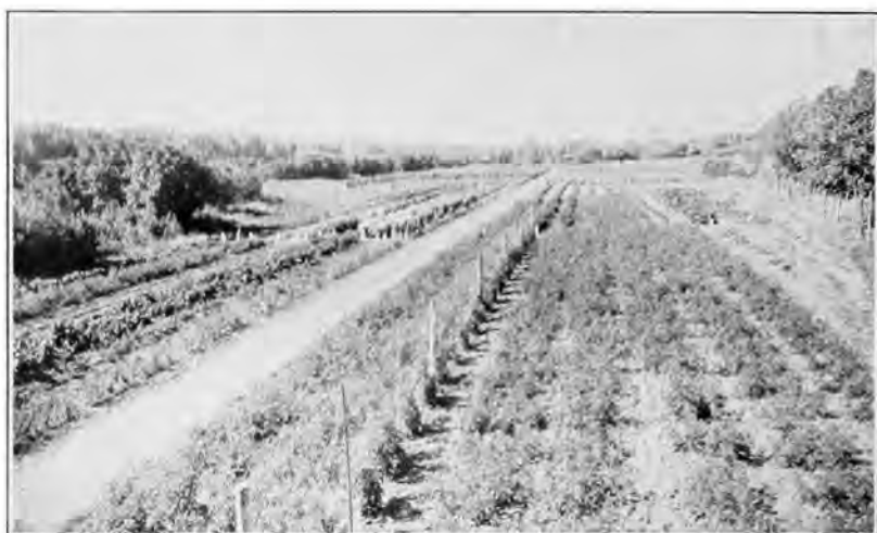
The Experimental Gardens Furnish Vegetables for the Table Most of the Time