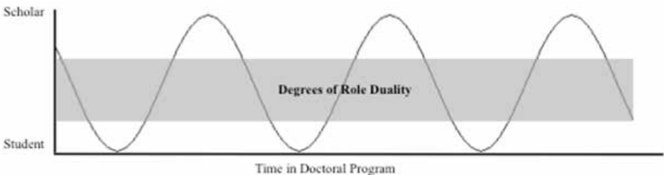
Figure 2: Oscillating Role Identity

The answer to the second research question highlighted that each student’s journey was different; however, the salient commonality that aided significantly in the navigation of their doctoral process was the creation of support communities. Whether it was peer-to-peer or mentor-advisor support, the participants explicitly stated throughout the interviews that