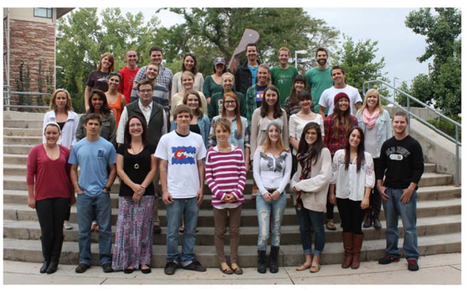
Fall 2013 Center for Public Deliberation Student Associates

CPD Student Associates are CSU undergraduates that are chosen for the program through an application process. Student associates (SAs) typically make at least a two semester commitment, but a one semester program is available for graduating seniors. Student Associates receive 3 hours of SPCM 408 (Applied Deliberative Techniques) credit their first semester and then SPCM 486 Practicum credit for subsequent semesters. Approximately 15 new students are selected to begin their work with the CPD each semester, and they join returning students who completed their first semester of the program in a prior semester. Student associates are trained to be impartial researchers, conveners, facilitators, and reporters of public discussion, and are involved in all aspects of CPD projects.