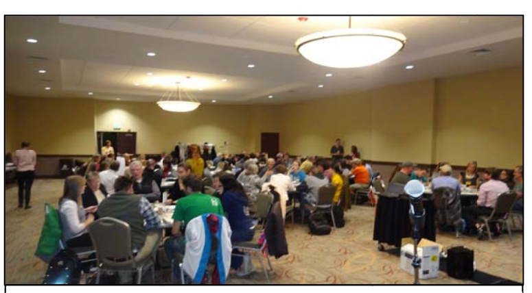
Participants at the first Community Issues Forum at the Lincoln Center

On October 10, the CPD and the city of Fort Collins hosted what will hopefully become an every semester tradition with the first "City Issues Forum" event. This event focused on four topics currently of interest to city council that called for further public engagement. The hope of this event is that by combining multiple topics, we would be able to attract a broader audience that may only be