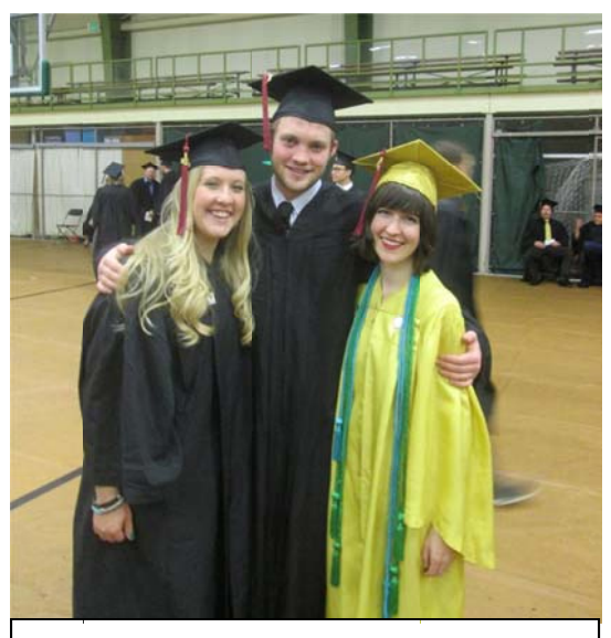
FALL 2013 CPD GRADUATES

A bittersweet aspect of the CPD student associate program is that we must say goodbye to very special students at the end of every semester, as they graduate and move on to great things.