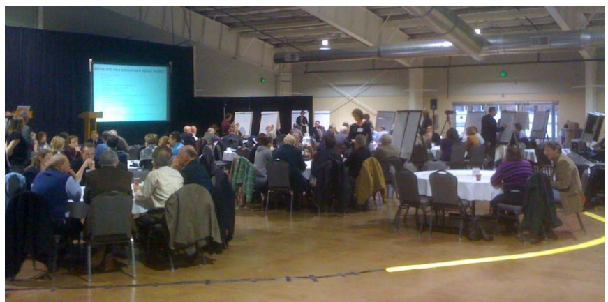
Community members from across Northern Colorado gathered at the Ranch for an initial workshop to kick off the Embrace Northern Colorado project. CPD student associates facilitated each of table breakouts.

ENC is a multi-year project focused on addressing issues related growth and regionalism in Northern Colorado. CPD students and staff facilitated an initial workshop in January engaging 70 leaders from Larimer and Weld counties, assisted with the kickoff event in January that attracted 500 attendees, and then designed