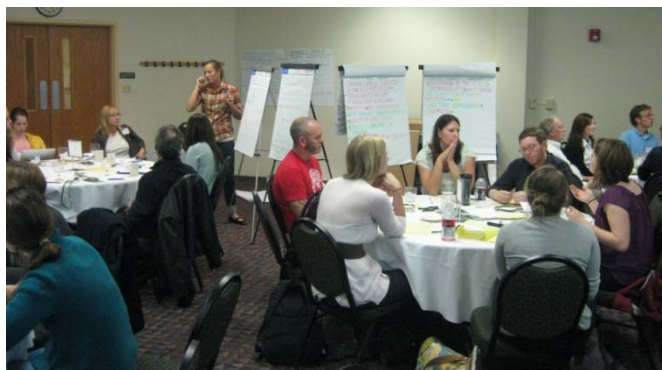
Faculty members at CSU participate in the Master Teacher Initiative forum at the Lory Student Center. CPD student associates facilitated.

In the spring of 2011, we worked with The Institute of Teaching and Learning, the Master Teacher Initiative, and the College of Liberal Arts to host a “Faculty Forum on Improving Undergraduate Education through Teacher-Student Reciprocity” on April 21. Thirty-two faculty members and graduate students from 14 different CSU departments participated in the process. The primary focus of the process was having the faculty work in small groups to develop lists of key responsibilities for both students and faculty. Based on the concept of “student-faculty reciprocity,” we planned to identify these key responsibilities, and begin to identify critical gaps between the perceptions of faculty and students. At the end of the short process, the wireless keypads were utilized to prioritize the responsibilities for both students and faculty, as well as query the faculty concerning the extent to which they believe students and faculty currently fulfill those responsibilities.