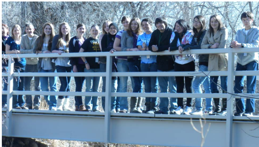
Members of the PSD Think Tank take a break from their CPD facilitation workshop at the Tamasag Retreat Center north of Fort Collins.