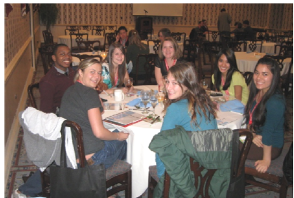
CPD student associates enjoy breakfast during the Citizen's Toolbox conference in Oxford, Ohio