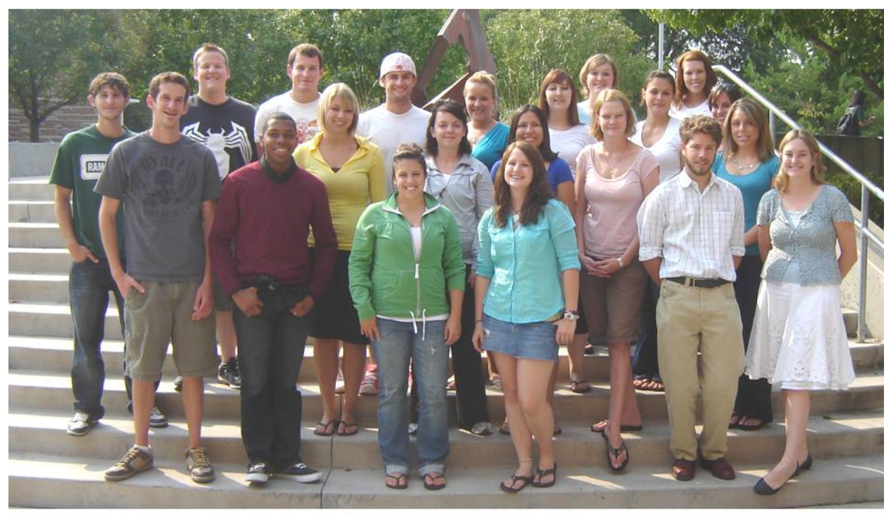
Fall 2009 Center for Public Deliberation Student Associates

Student associates are trained to be impartial researchers, conveners, facilitators, and reporters of public discussion, and are involved in all aspects of CPD projects.