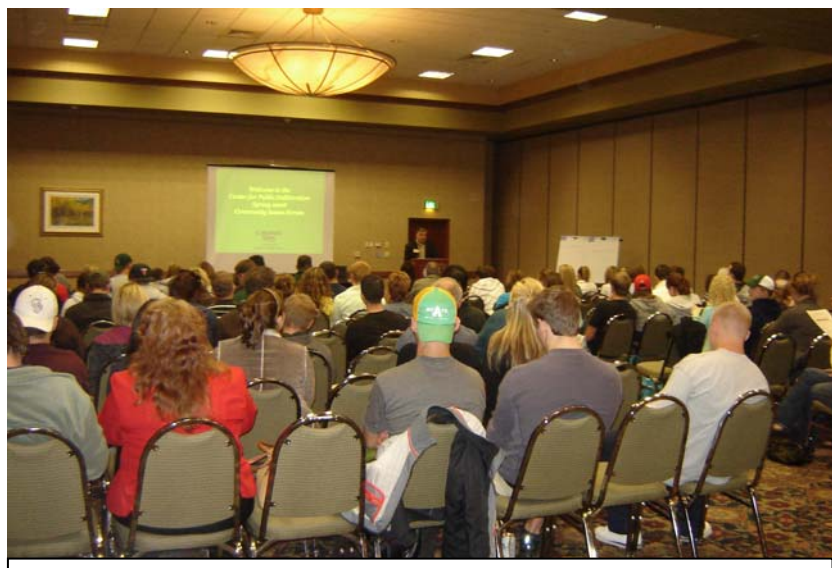
The opening presentation to the 2008 Community Issues Forum

On April 21<sup>st</sup>, 2008, CSU Center for Publication hosted the second annual Community Issues Forum, held at the first time at the Hilton Hotel in Fort Collins, Colorado. The event was moved off-campus to the Hilton in order to attract a broader community audience. The purpose of this event was to offer both citizens of the Fort Collins community and students of Colorado State University the opportunity to deliberate and discuss four