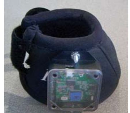
Figure 2: Close up image of a sensor.