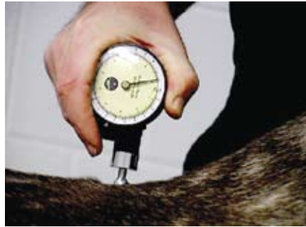
Pressure algometer used to evaluate pain reception.

twitch) was noted. The pain perception levels were repeatable and increased in a cranial-to-caudal gradient within the vertebral column. The regional pain pressure levels in the cervical region were 9 kg/cm 2 ; thoracic region were 12 kg/cm 2 ; lumbar region were 13 kg/cm 2 ; and pelvic landmarks were 16 kg/cm 2 . Higher pain threshold levels were measured in horses that were ridden and actively exercised, compared to unriden horses. This pressure gauge provided an objective, noninvasive, and repeatable tool to measure pain perception levels in horses.