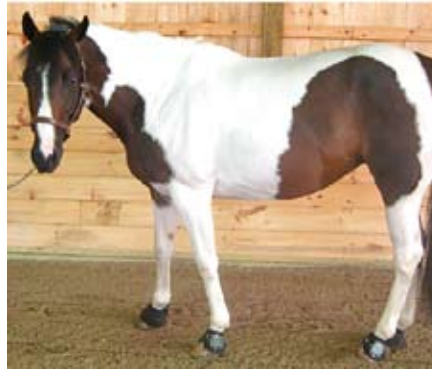
Figure 1: Horse showing sensors attached to the feet and the pole.

This breakthrough technology has the potential to be used to monitor the limbs of racehorses and potentially prevent catastrophic injury. In addition, the goal of this collaboration is to create a user-friendly software interface with veterinarians so that it can be used as part of the routine lameness examination in clinics. The collaborative group is at this time testing the system against objective measures of lameness and should have those data in the next year.