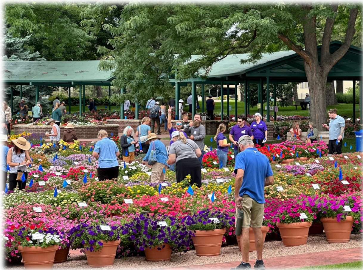
Evaluators on Industry Evaluation Day on August 8, 2023.