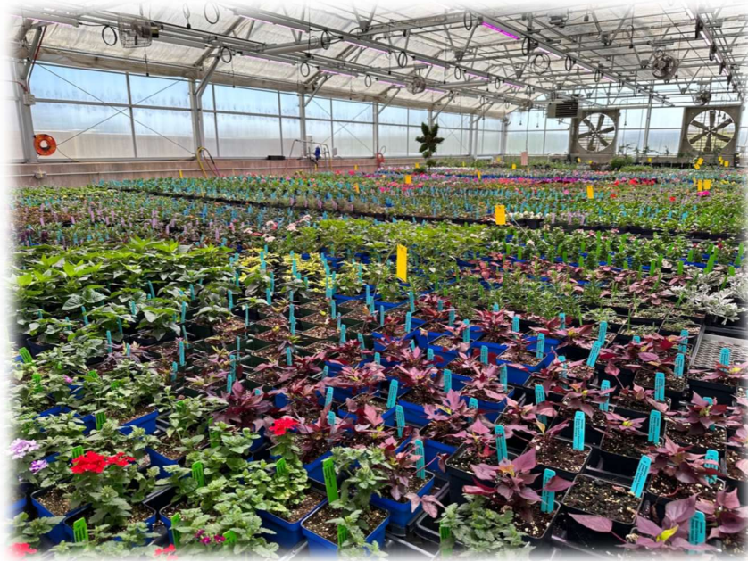
Trial plants growing in the Horticulture Center Greenhouse.

There were minor pest issues this spring in the greenhouse. Dominion (imadacloprid) was applied on May 15 th for aphids. Flagship 25WG (thiamethoxam) was applied as a treatment for aphids on May 23 rd and again on June 21 st .