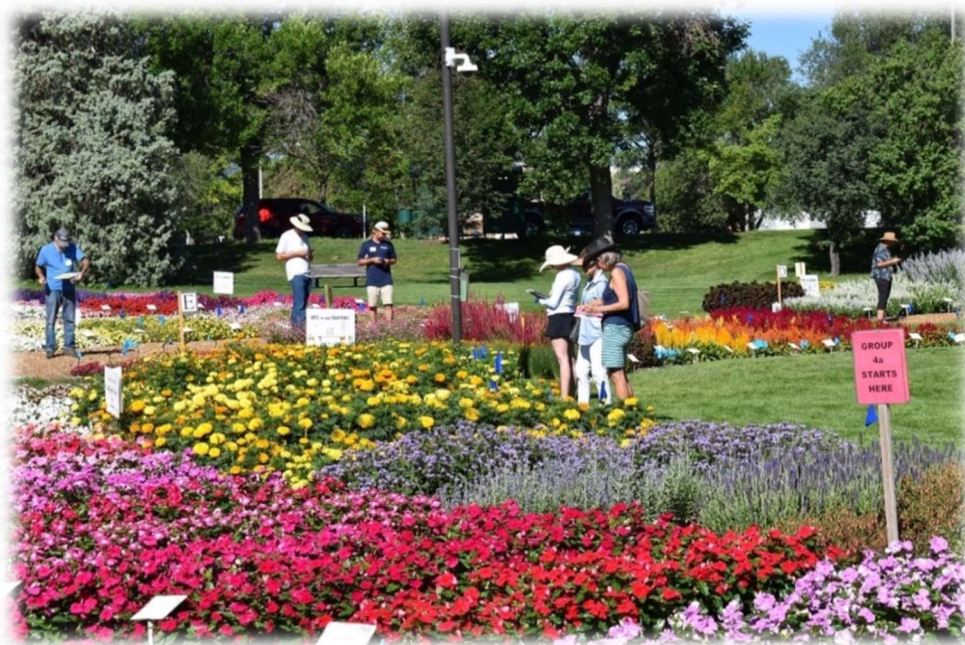
Individuals evaluating sun beds on Industry Evaluation Day.

Bloom period data for each variety has been taken since 2007. These data can provide insight and an indication for how long the plants were in bloom and how well they bloomed during that time period. Data were collected on a regular basis; every 7 to 14 days. Overall flowering data were based on a scale of 1 to 5, with 1 = plants not in bloom or have very few blooms and 5 = plants in full bloom or peak bloom (typically the stage at which the average consumer perceives the plant as being in perfect bloom). One should take into consideration the broad range between these ratings when interpreting these data. If a variety started at full bloom (5), it means it was already in full bloom in the greenhouse before it was planted. All these data are presented in numerical fashion in this performance evaluation. Near the end of the season, any dead plants in the trial were not considered in the evaluation: thus, the data given always reflects the percent of live plants in bloom.