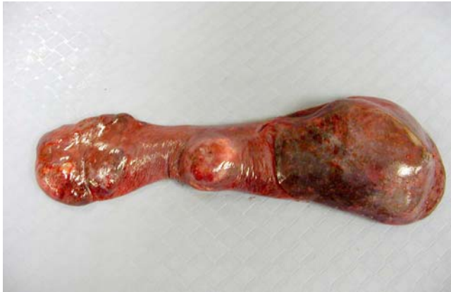
Enlarged spleen with three nodular masses. It is not possible to tell grossly if these will be benign or malignant.

hematomas. The most common malignant vascular tumor is hemangiosarcoma. Hemangiosarcomas of the spleen typically carry a guarded prognosis with a median survival of 1 to 3 months with surgery alone. In one study, these tumors were graded for degree of differentiation, number of mitotic figures, nuclear pleomorphism, and necrosis. Survival was prolonged a few months using doxorubicin chemotherapy in patients with tumors that were well-differentiated (versus those that were anaplastic), where there was no gross evidence of metastatic disease, and where the spleen had been removed. In various reports, use of chemotherapy after surgery results in median survival times of 5 to 11 months.