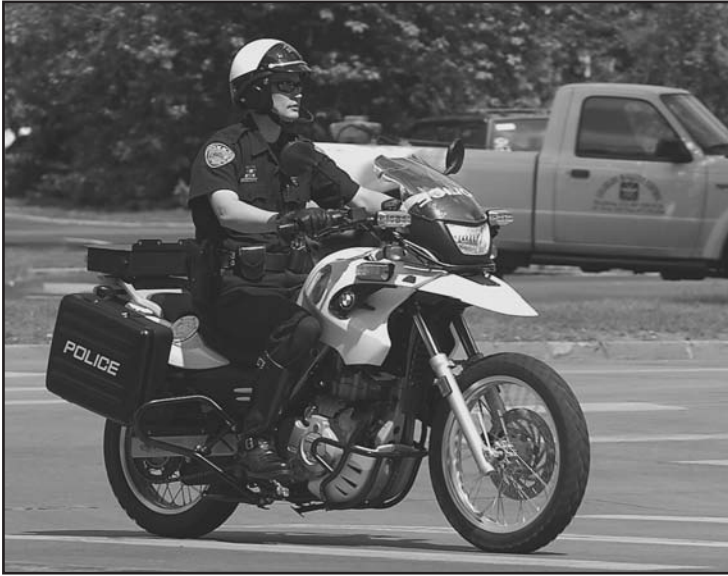
Motorcycle officer patrols campus