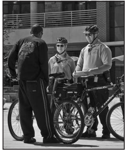
CSOs handling bicycle violation

Drivers must obey all Colorado and Fort Collins laws and ordinances and University TEEP (Traffic Education and Enforcement Program) regulations, which are enforced civilly here at CSU. TEEP violations do not effect points on the driver’s license.