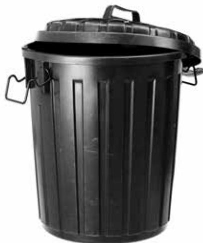
Trash Can $10