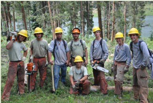
Western Colorado Conservation Corps saw crew at Sylvan Lake