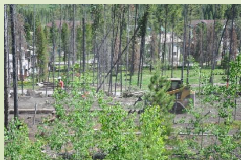
Removing trees in the railroad easement - Winter Park

Overview: Thirteen projects were active during the three-month timeframe. Jobs associated with the Community Wildfire Protection (CWPP) grant increased 26 percent, while jobs associated with the forest restoration grant increased 53 percent.