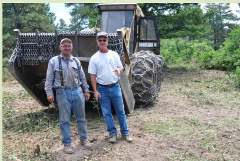
Hydro-axe operator and contract administrator at Perins Peak SWA