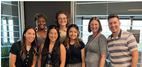
Office of Equity Staff - 2023

If a victim is not sure about making a police report or initiating a university investigation, the individual can receive free, confidential information, advocacy, and support by calling the Phoenix Center at Anschutz at 303-724-9120 to make an appointment. The Phoenix Center also has a free and confidential helpline available 24/7 at 303-556-CALL (2255).