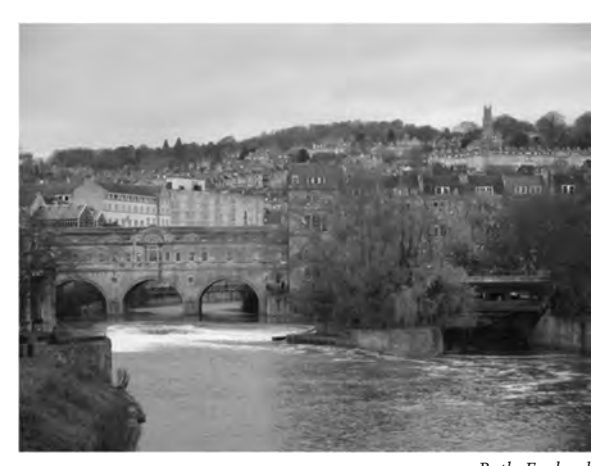
Bath, England