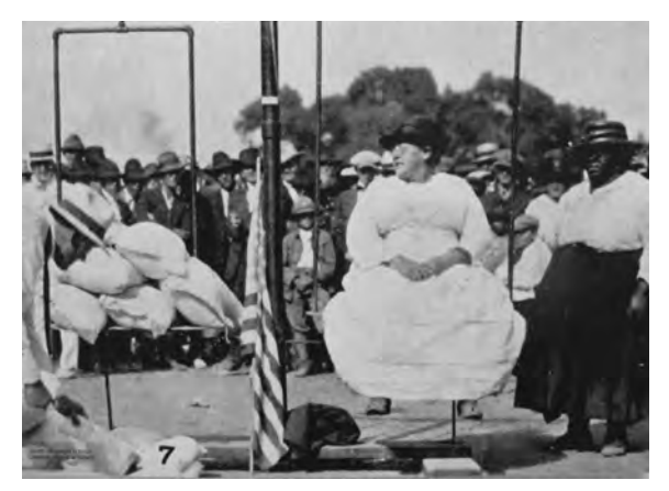
Largest woman competition, sponsored by CF&I

family contest, and a heavyweight contest, which was literally a prize for the heaviest woman in attendance.<sup>17</sup> Given that these competitions took place during the same time as the Suffrage Movement in America, the efforts of CF & I in sponsoring YMCA Field Days have typically been seen by ethnic studies and gender studies of the company as part of a larger company effort to reinforce older social norms in opposition to the Suffrage Movement.<sup>18</sup>