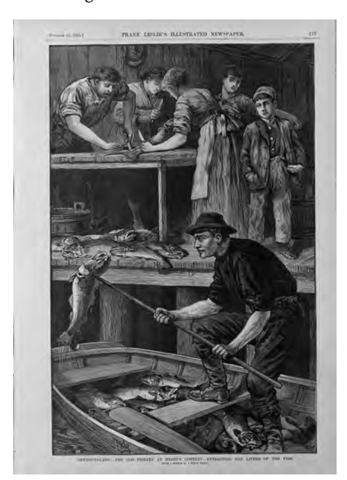
"Cod fishery at Heart's Content, Newfoundland."

The Massachusetts Bay Company was the colony's governmental entity, and it carried hefty influence throughout New England. While the exportation levels that Great Britain required of its colonies certainly encouraged the local economy to grow by providing a hungry market, the Company's role as a prominent, silent actor in the economic evolution of New England is often overlooked. The demands from Old World required a strong, internal economic structure able to effectively manage Massachusetts' resources.