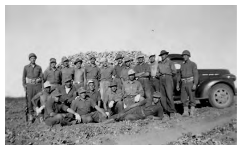
German POWs on a sugar beet farm

The relationship between German prisoners of war and the soldiers stationed at the camps was an interesting one. The official handbook given out by the U.S. Army to those stationed at the prisoner of war camp in Trinidad covered general army information, as well as the protocol for interacting with prisoners of war. According to the handbook,