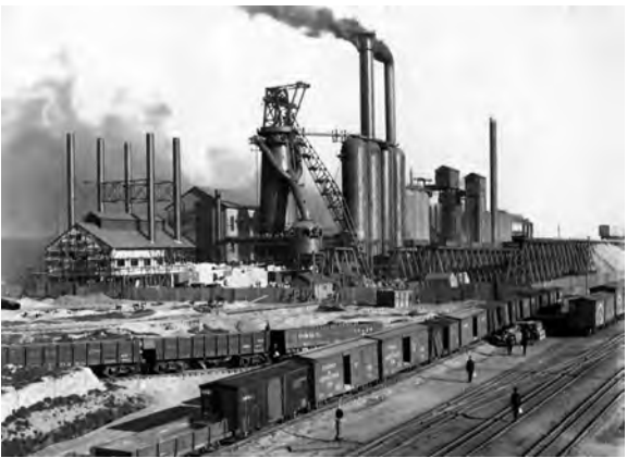
Processing at the mill