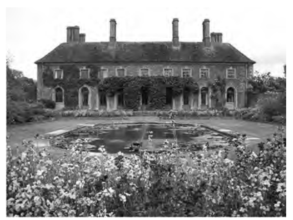
Barrington Court, England