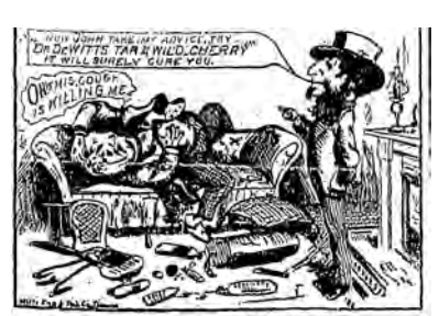
SYRUP TAR AND WILD CHERRY

argued that drugs that created similar symptoms to diseases that their patient had would help to cure the patient. For example, if a patient exhibited symptoms of a fever, the homeopath would prescribe a diluted form of a drug that produced symptoms of a fever in their belief that "like cures like." At the height of their popularity, homeopathic practitioners accounted for fifteen percent of America's medical practitioner population, and this same trend was evident in Colorado. The electric school of medicine originated with the magnetic school of medicine, which believed that medical therapy could be accomplished by the redistribution of the body's forces with the use of magnets. During this period, electricity was invented and eventually replaced the use of magnetism as a way to redistribute the body's forces. Due to its new relatively recent conception, only a small number of physicians were practicing electric medicine, and little was known about its medicinal uses when regulation legislation was passed in Colorado.