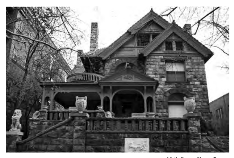
Molly Brown House, Denver