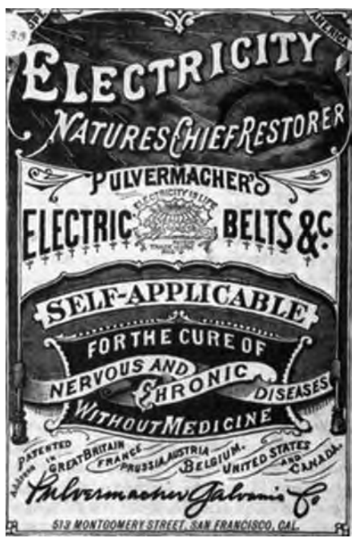
An electric belt – a typical tool used by electric physicians

In Colorado, the most abundant non-traditional physicians belonged to the homeopathic and electric schools of medicine. Homeopathic practitioners did not believe in germ theory, aseptic techniques, or many of the measures taken to protect public health. They