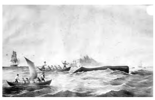
"Nantucket whalers harpooning their catch."

Massachusetts was a prime geographic location for a lucrative fishing trade. The climate and the Native American tribes in the Massachusetts Bay were much more accommodating to the Puritan settlers than the sultry climates and antagonistic tribes in Virginia and the Carolinas. Plantation owner and merchant Samuel Maverick, writing in 1660, created a list of every large settlement in New England. In his index,