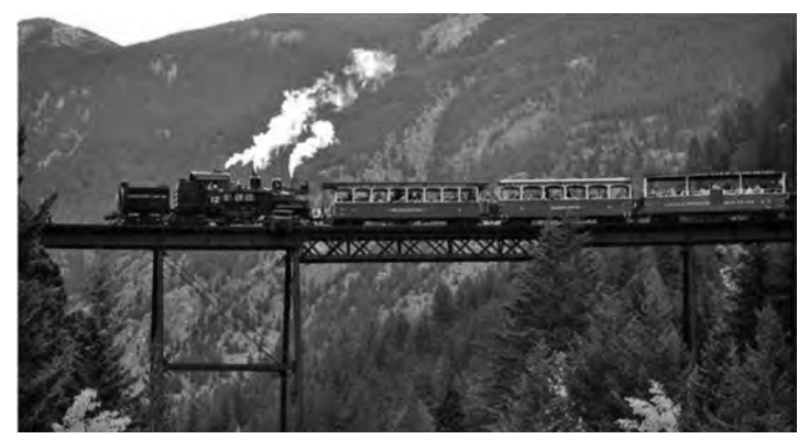
Georgetown Loop Railroad

Designated a National Historic Landmark in 1966, the Georgetown/Silver Plume Historic District is a unique setting in the Colorado Mountains. It consists of the towns of Georgetown and Silver Plume, and the Georgetown Loop Railroad that runs between the them. In 1970, the residents of Georgetown created Historic Georgetown Inc, a private organization aimed at saving the historic quality of Georgetown. Very few of its structures have been lost since the creation of the organization. The history of the area as well as the number of historic properties in the town makes it one of the more special parts of Colorado, particularly for preservationists.<sup>57</sup>