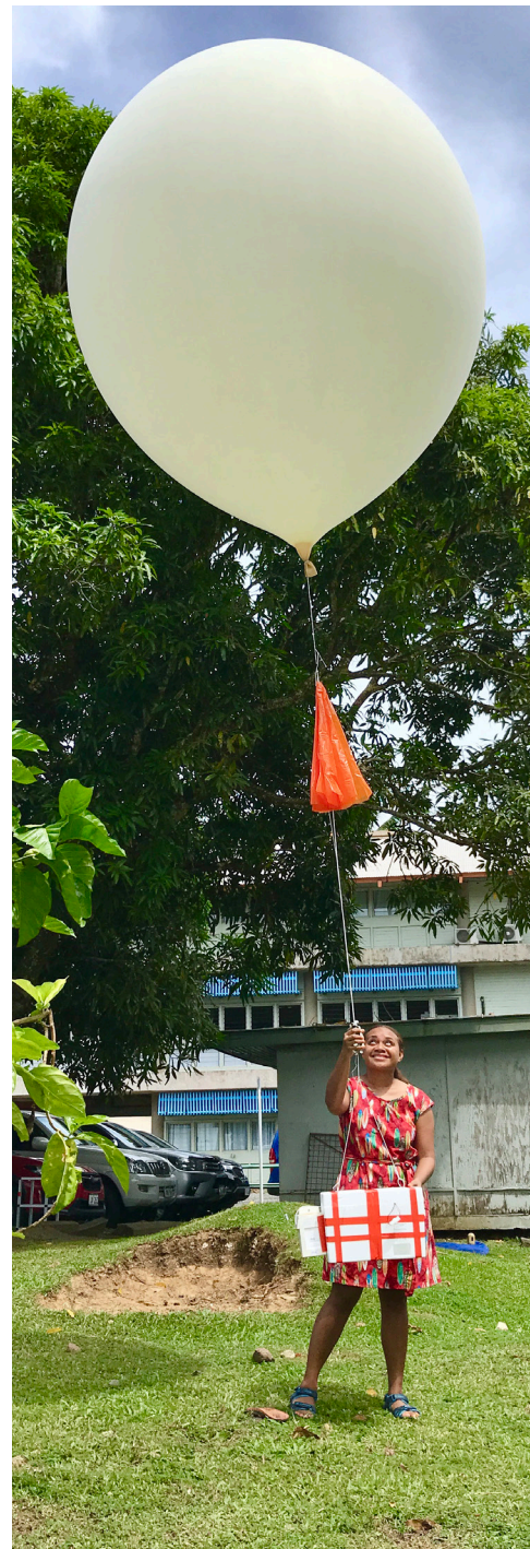
A graduate student at the University of the South Pacific in Fiji launches a weather balloon carrying an instrument to measure ozone. CIRES scientists were critical in helping NOAA measure stratospheric ozone and surface ozone at 17 locations around the world.