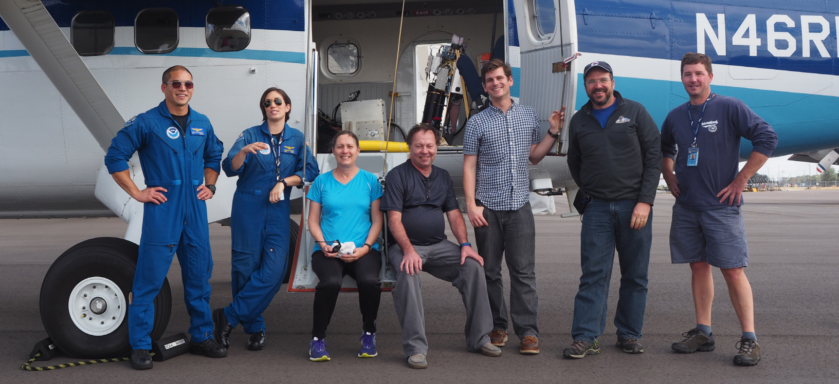
CIRES and NOAA researchers from the Chemical Sciences Division with the NOAA Twin Otter flight crew during the January 2018 FireWinds experiment in Florida. The team developed a state-of-the-art MicroDoppler lidar to measure complex wind flows around wildfires. It's part of a broader effort to study atmospheric processes in the boundary layer, the troposphere, and ocean ecosystems using innovative techniques.