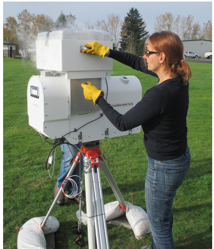
Liquid nitrogen calibration for the Radiometric Microwave Radiometer in Troutdale, Oregon. CIRES scientists in PSD developed a real-time, hourly-updated, online data product that helps forecasters at the Portland NWS Forecast Office monitor cool season easterly gap flow events to guide warnings to the public about potential weather-related hazards such as snow, freezing rain, and strong winds.