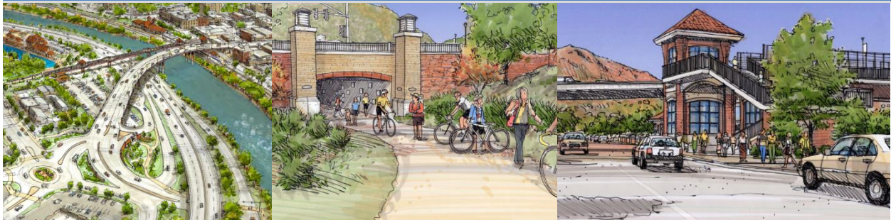
Images 4-6 below, Region 3 Grand Avenue Bridge Renderings