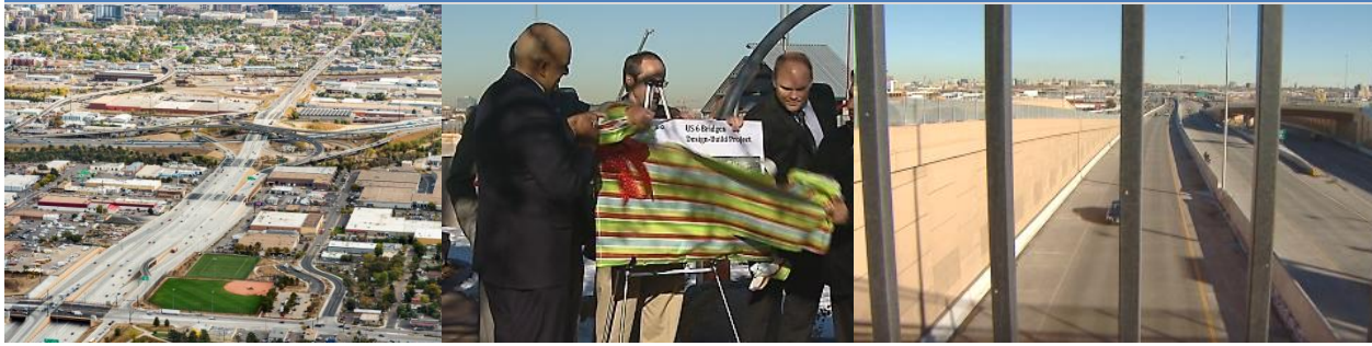
Images 1-3 below, 6 th Ave. D/B completion, Dec. 2015 ribbon-cutting ceremony.