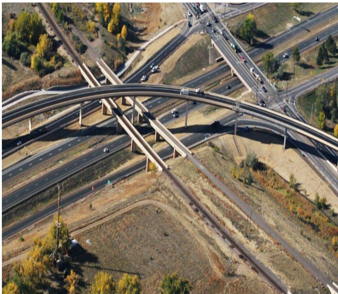
C-470 & Sante Fe Drive