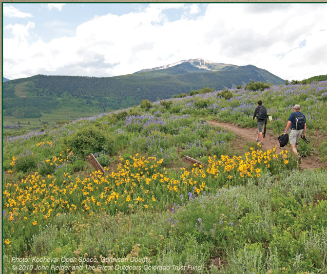
Kochevar Open Space, Gunnison County