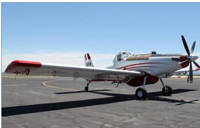
COLORADO'S SINGLE ENGINE AIR TANKER

SEATs have consistently proven to be very effective as initial attack firefighting resources. The SEATs' load (approximately 800 gallons) is smaller than the large air tankers' load, but their mobility, speed, and accuracy make them ideal for fighting fires in in lighter sage, brush, and grass type fuels.