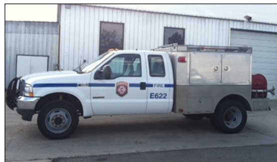
DFPC TYPE 6 ENGINE

DFPC currently maintains nine Type 6 Engines and four Type 4 Engines. 3 In order to make the most of existing resources and provide assistance to local entities in wildland firefighting, DFPC has implemented alternative staffing models, such as engines jointly staffed by DFPC and local personnel. Under this program, DFPC