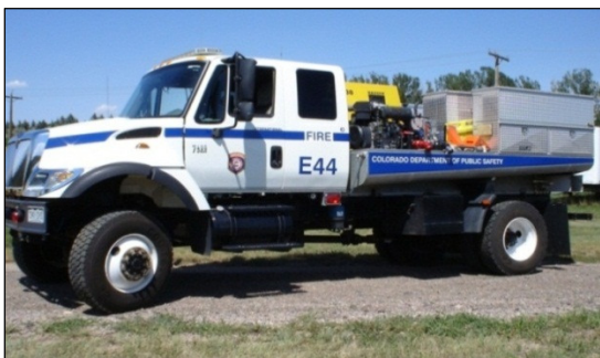
DFPC TYPE 4 ENGINE

While suppression is the most visible function of the program, the engine crews also provide a wide range of forestry and fire related services including critical wildland fire training to local jurisdictions. The engine crews also provide valuable fuels reduction services. In conjunction with the Division of Natural Resources (DNR) and the Colorado State Forest Service (CSFS), the crews work on state lands to reduce hazardous fuels and increase forest health. This is done through various methods including general thinning, chipping, pile burning and broadcast burning.