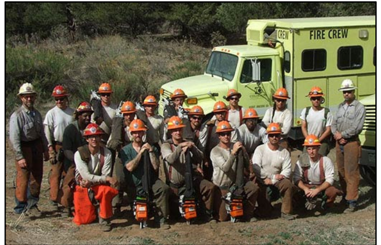
The Buena Vista SWIFT Crew on the Hewlett Fire (May 17, 2012)

Following the 2000 fire season, the Division of Correctional Industries (CCI) began forming a wildland fire team to provide hand crew support and assistance on wildland fires within Colorado. CCI currently operates three, 20 member State Wildland Inmate Fire Team (SWIFT) crews, one each in Canon City, Buena Vista, and Rifle. CCI also operates a half crew of trained offenders in Rifle that they have doubled in size during the last two fire seasons to operate as a 4th crew. Last season the crews worked on 22 incidents, 31 assignments, including the Boulder Flood incident, for a total of 147 days on assignment.