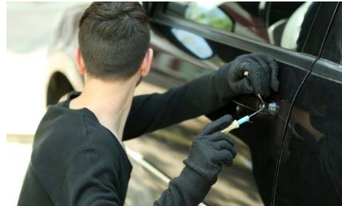
Figure 1. (U) National Insurance Crime Bureau (NICB) photo

(U) Disclaimer: Information contained in the ATICC Stolen Vehicle Database Repository (ATICC database) is considered dynamic; modifications to records are made on a daily basis. Stolen vehicle records were screened for accuracy and standardized prior to their use in this report.