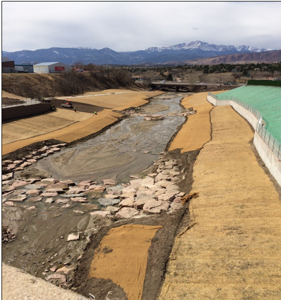
Colorado Springs Cottonwood Creek Stabilization - FY 2011 PDM Project

Pictured below are some of the Pre-Disaster Mitigation projects currently underway in Colorado.