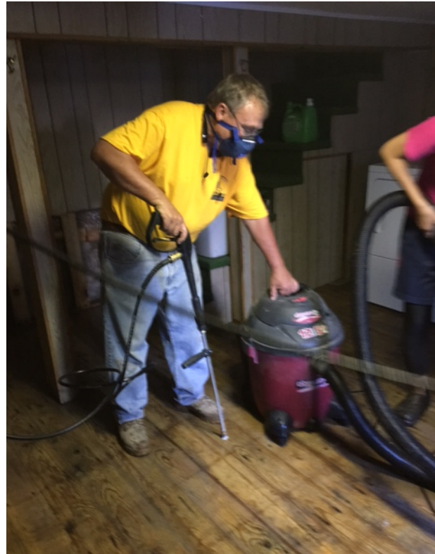
Volunteers from the Colorado Baptist Disaster Relief (CBDR) remove mud and affected drywall from a Naturita basement.

The Colorado Baptist Disaster Relief has been conducting clean up and muck-out activities across the state. Members of the organization, including those from Wyoming, Utah and Idaho chapters, completed ash-outs and for nine households affected by the Cold Springs Fire. The group continues to provide clean up assistance to residents affected by the recent Naturita flooding and the Colorado Springs Hail Storm.