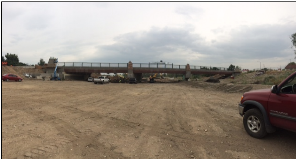
Longmont St. Vrain River Flood Control/Bridge Replacement - FY 2012 PDM Project