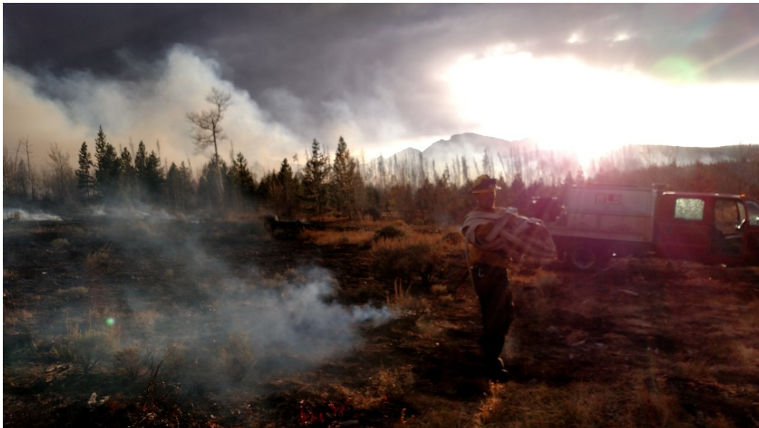
(Lake Dillon Fire Rescue)

DHSEM is working with governments, private-nonprofit organizations, and other critical partners on the following mitigation and recovery efforts.