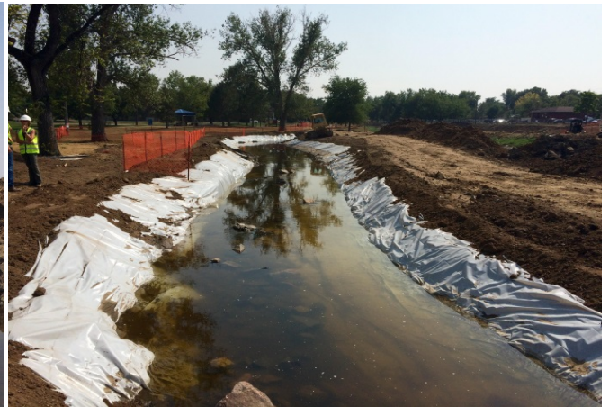
Work is nearly halfway completed for the FMA 2011, Lower Westerly Creek Flood Control Improvement Project in the City of Aurora.