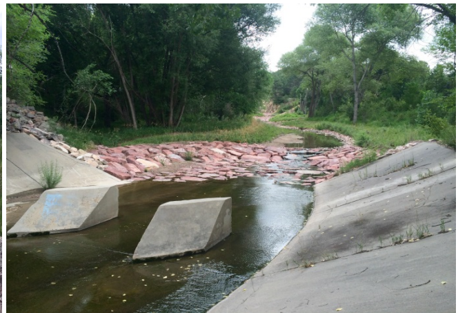
Completed improvements of the PDM 2012 Greencrest Channel Stabilization project in the City of Colorado Springs. The project was completed on scheduled and nearly $1.5 Million under budget!