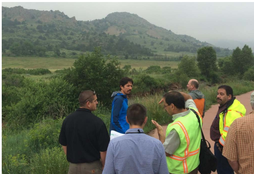
State & FEMA Mitigation staff met with Colorado Springs Public Works in the Garden of the Gods Park in Colorado Springs to review a proposed flood mitigation project for HMGP DR-4145.