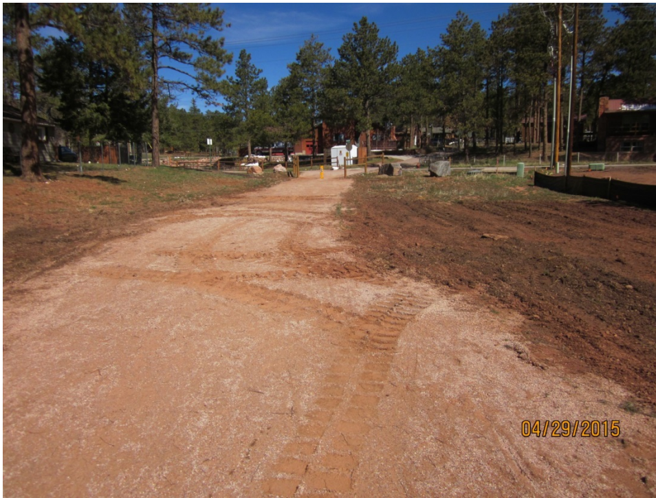
Before & After: Photos of the Fountain Creek Stabilization and Erosion Control project funded by a 2010 Pre-Disaster Mitigation (PDM) grant. The photos above are looking north, just south of Sheridan Avenue in Woodland Park.