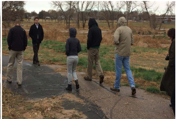
On March 25, 2011, Mitigation and Recovery staff visited the City of Evans to conduct site inspections for Public Assistance projects and answer questions.