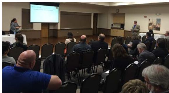
The City of Evans held a public hearing on April 15, 2015 to receive input to the State’s amendment to the current Community Development Block Grant – Disaster Recovery (CDBG-DR) Action Plan.