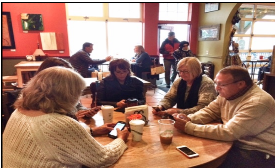
The group had planned to meet in Allenspark, but due to the weather, COVOAD members had to work together to quickly secure an alternate location for the workshop in Lyons. Thank you to the Lyons Chamber of Commerce for allowing us to use the space!