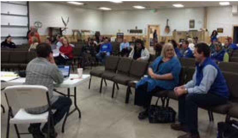
The Larimer Long Term Recovery Group meeting held on March 10, 2015 in Loveland.