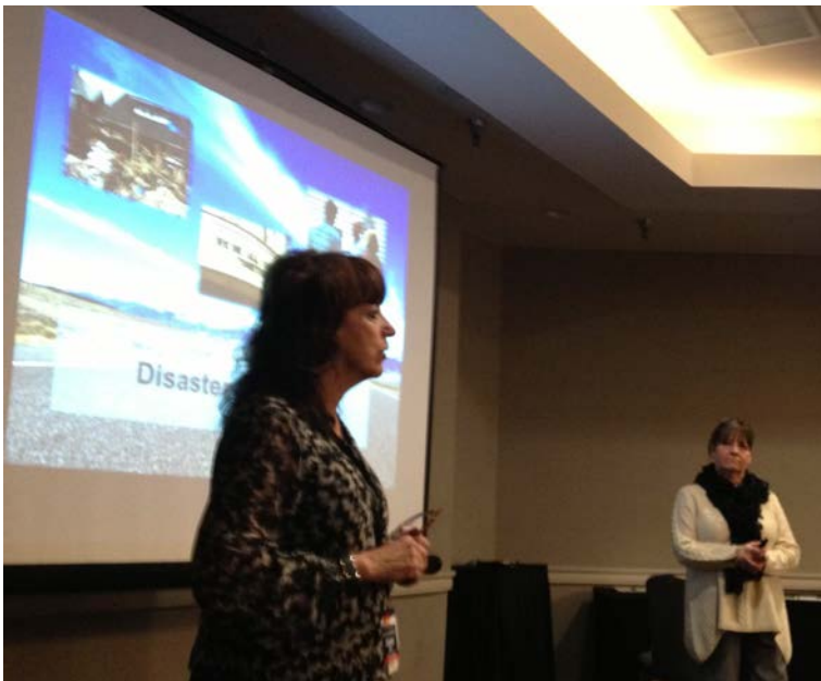
The Disaster Case Management Program was highlighted in two sessions of the 2015 Emergency Management Conference.