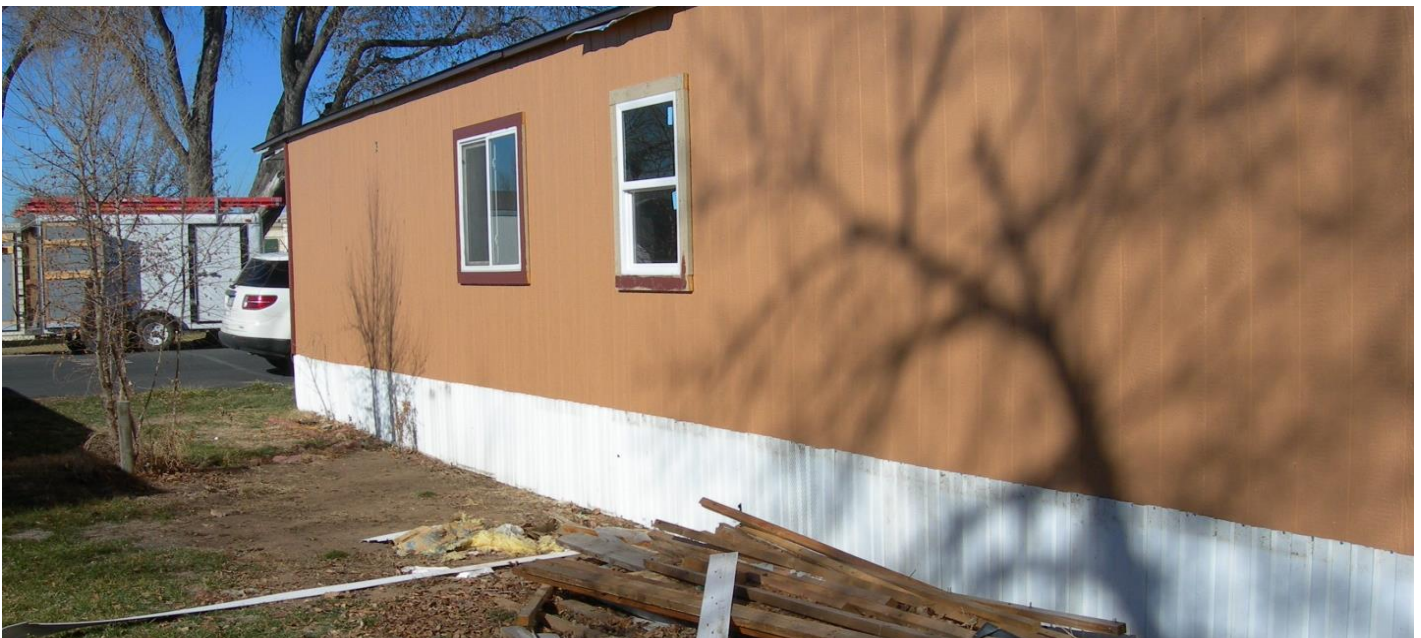
Christian Public Service provided services to rebuild the skirting on a mobile home for a family affected by the floods.