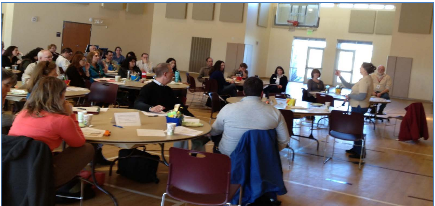
The "Long Term Recovery When Rebuilding Is Involved." workshop held at Redeemer Lutheran Church in Fort Collins.