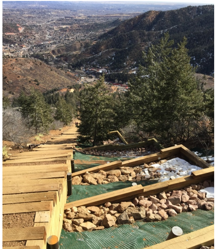
Location of the proposed HMGP project along the Manitou Incline in Manitou Springs, Colo.