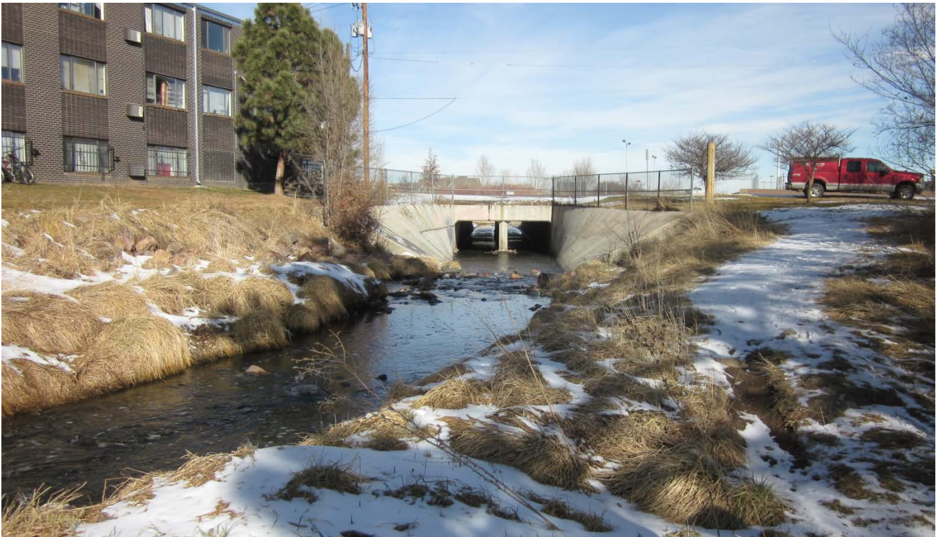
Montview Boulevard box culvert to be replaced on Westerly Creek