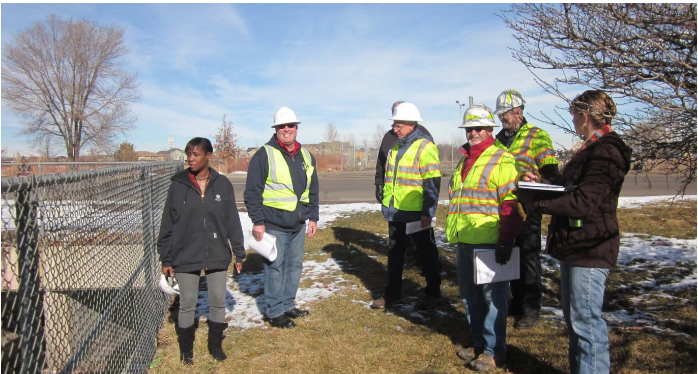
Aurora Public Works team at Westerly Creek