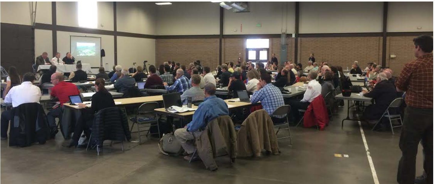
The Lessons Learned: 2013 Front Range Disasters workshop held on January 29, 2015 identified lessons learned, challenges and other valuable experiences taken from the response to and recovery from large disasters.