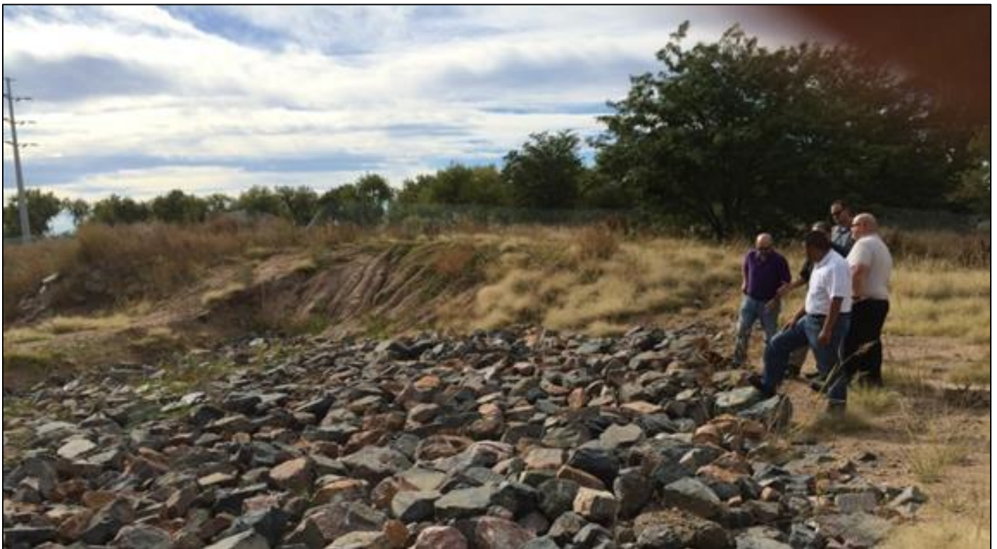
Evans berm inspection team at the field inspection of this NRCS project.

DHSEM is coordinating the following mitigation and recovery efforts with government, private-nonprofit organization, and other critical partners.