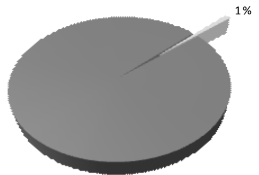
Share of Statewide General Fund

■ State General Fund Total ■ Department General Fund Total