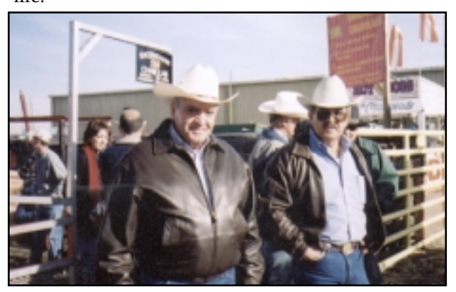
These two gentlemen traveled all the way from Mexico to attend Stock Show events.

The National Western Stock Show, which runs January 10-25, is a great place for family fun and education. With the world's fourth-largest regular season professional rodeo, dancing horses, innovative technology, and 375 vendors selling everything from jewelry and household items to agricultural products, equipment, and more, there's something to keep everyone coming back time and time again. The Colorado Department of Agriculture is proud to be a part of this great celebration of agriculture and the western way of