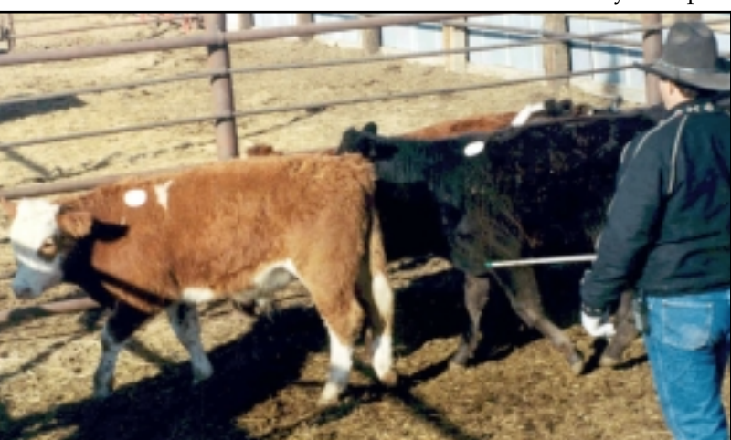
A brand inspector verifies ownership of a cow.

While this annual occasion attracts more than 640,000 people and creates an $80 million impact, it also draws 1\ \ \, 5\ \ \, ,\ \, 0\ \ \, 0\ \ \, 0 different animals. It's the job of CDA b r a n d inspectors to v e r i f y ownership of