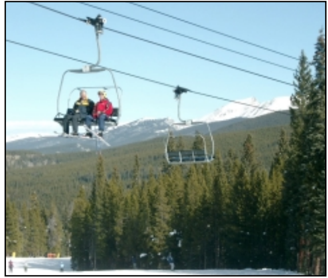
Another beautiful day greets skiers at Winter Park, Colorado.

Crested Butte also boasts an expansive new terrain park this season that will include 10 jump features of various shapes and sizes and more than a dozen rail options. In addition, the resort unveils its new