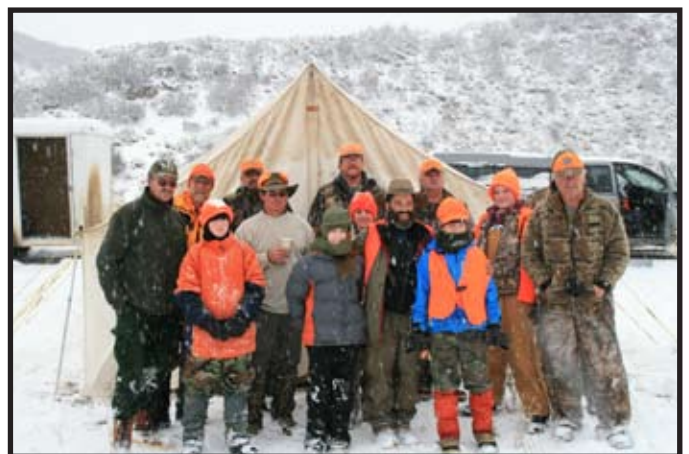
Education, license sales, recruitment programs and more