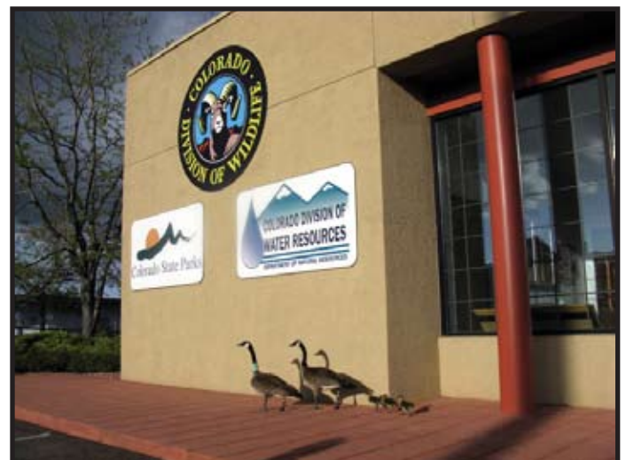
Wildlife viewing at the Colorado Springs office. This family arrived after hours to find the office closed.