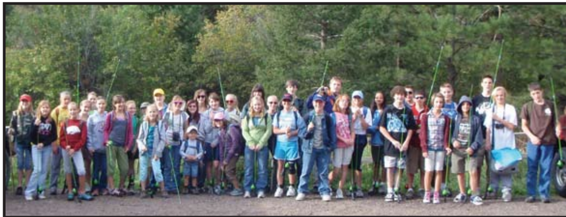
Future anglers pose before a fishing day at Palmer Lake, Southeast Region.

NORTHEAST Currently vacant 6060 Broadway Denver 80216 (303)291-7369