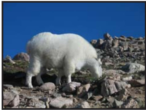
A great photo from the Mt. Evans mountain goat survey.