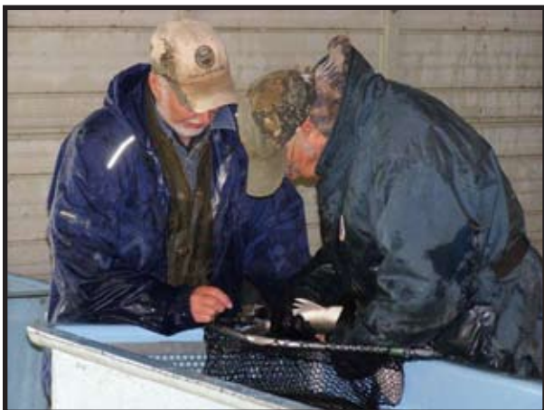
Outreach and assistance for aquatic programs