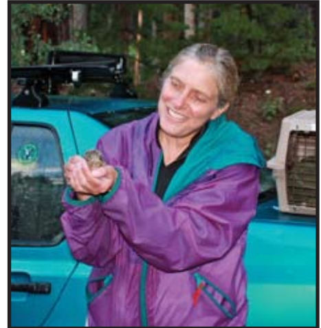
Transporting sick and injured wildlife to rehabilitation