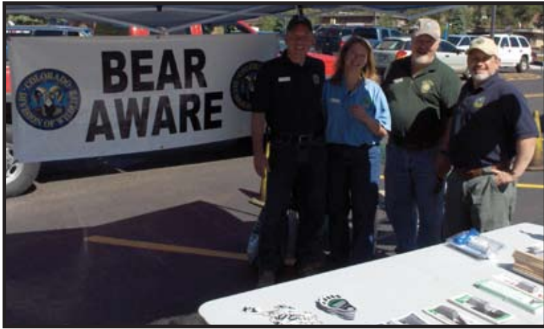
Community outreach on reducing human-bear conflicts in bear country