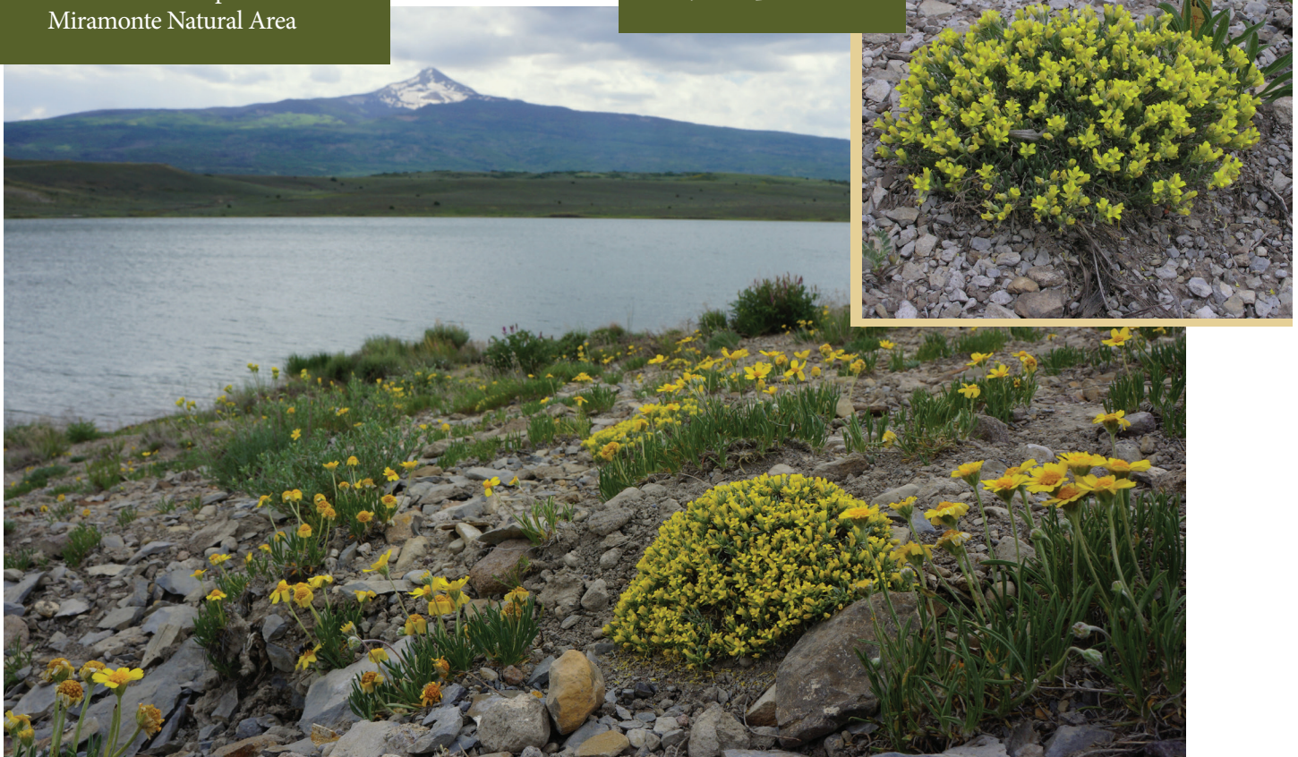
Cushion bladderpod ( Physaria pulvinata )