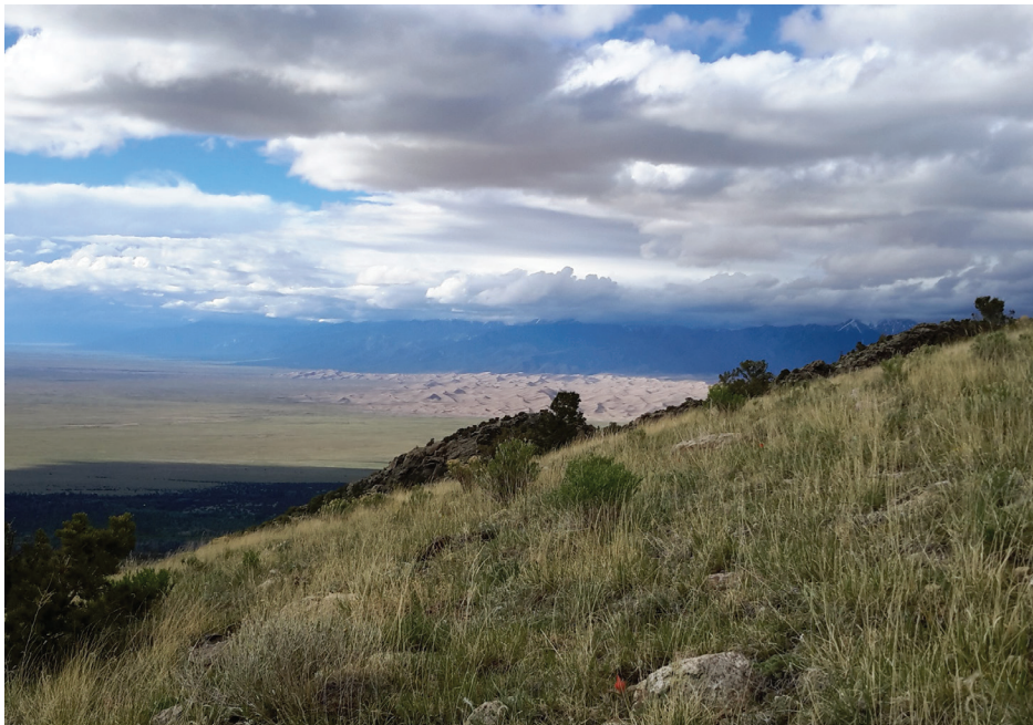
View of Great Sand Dunes & Sangre de Cristos from Zapata Falls Natural Area

This natural area is included in the State Land Board's Stewardship Trust, and is part of the State Trust Land Public Access Program, a program through which Colorado Parks & Wildlife leases land from the State Land Board to provide public access for wildlife-related recreation ( https://cpw.state.co.us/placestogo/Pages/StateTrustLands.aspx ). Access to this property is open year-round for wildlife viewing. There is a BLM campground below the trail to the falls, and the 8.8 mile South Zapata Trail continues on from the falls into the Sangre de Cristo Wilderness.