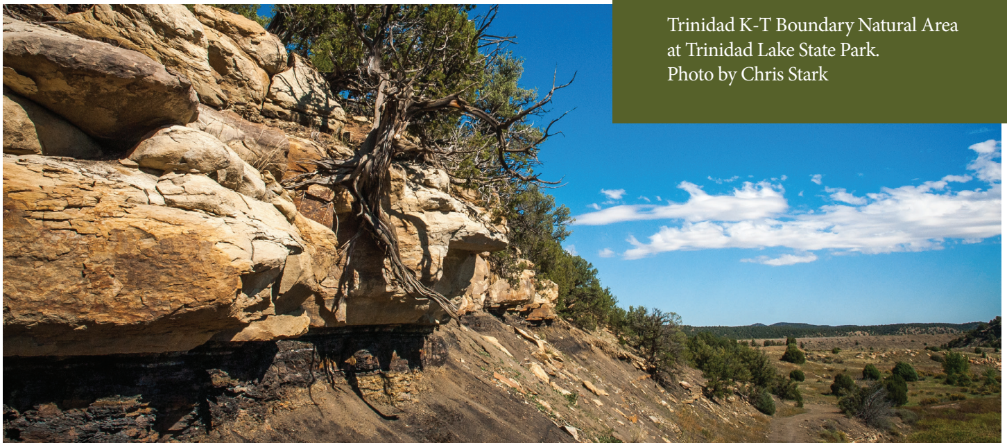
Trinidad K-T Boundary Natural Area at Trinidad Lake State Park.

CNAP volunteer stewards are invited to join CNAP staff on Thursday April 18th, 2019 for a tour of the Trinidad K-T Boundary Natural Area at Trinidad Lake State Park. This is one of the best places in Colorado to see the Cretaceous-Paleogene boundary that records the extinction of dinosaurs 65 million years ago. Pack a lunch and enjoy a short informative hike with CNAP & CPW staff. The Trinidad area also has great opportunities for enjoying the outdoors and includes several historical points of interest along the Santa Fe Trail. We plan to meet at the Longs Canyon Trailhead at 10am. Please RSVP and direct questions to dnr_cnap@state.co.us .