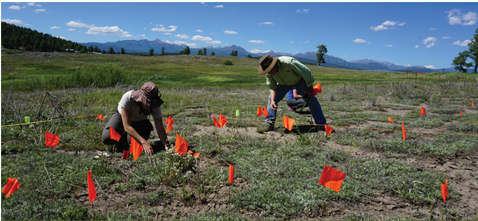
CNAP and partners monitoring the federally endangered Pagosa skyrocket

The summer of 2018 marked the second year of preliminary monitoring results. Between 2017 and 2018, we saw significant changes in Pagosa skyrocket density across the property that support anecdotal evidence that the plant has large population fluctuations. A similar quantitative method could be employed to monitor Pagosa skyrocket in other locations in order to develop estimates on the species total population size over time. In the future, we want to collect more environmental data to help figure out what factors are associated with fluctuations, such as plant community composition, disturbance, and soil temperature and moisture. These efforts have contributed to the growing body of knowledge about Pagosa skyrocket and CNAP will continue to work toward ensuring its conservation for future generations.