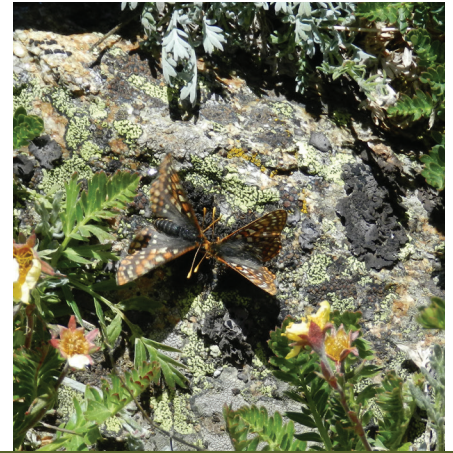
Butterflies at Treasurevault Mountain Natural Area