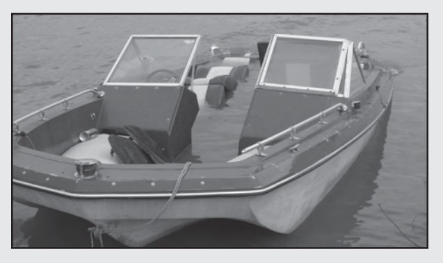
Don't let a flooded boat ruin your summer!

Colorado State Parks within five days and that you can get the boat accident form from our website? See Regulation #222 and Statue 33-13-109 go to http://parks.state.co.us/Boating/AccidentReporting for more information.