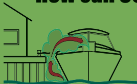
Blocked exhaust outlets