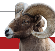
Bighorn ram