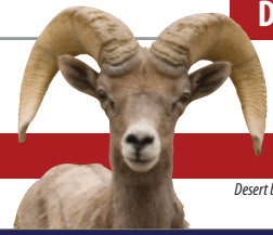
Desert bighorn ram