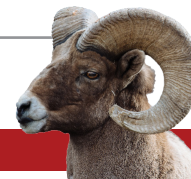
Bighorn ram