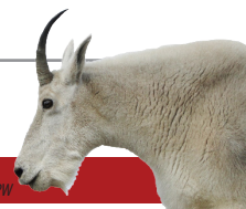
Mountain goat

It's difficult to tell the difference between male and female mountain goats. Refresher tutorial and tips, page 3.